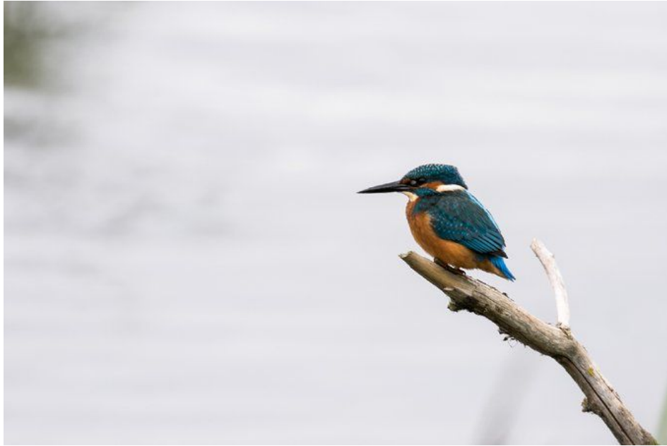
Kingfisher in front of the hide at Far Ings