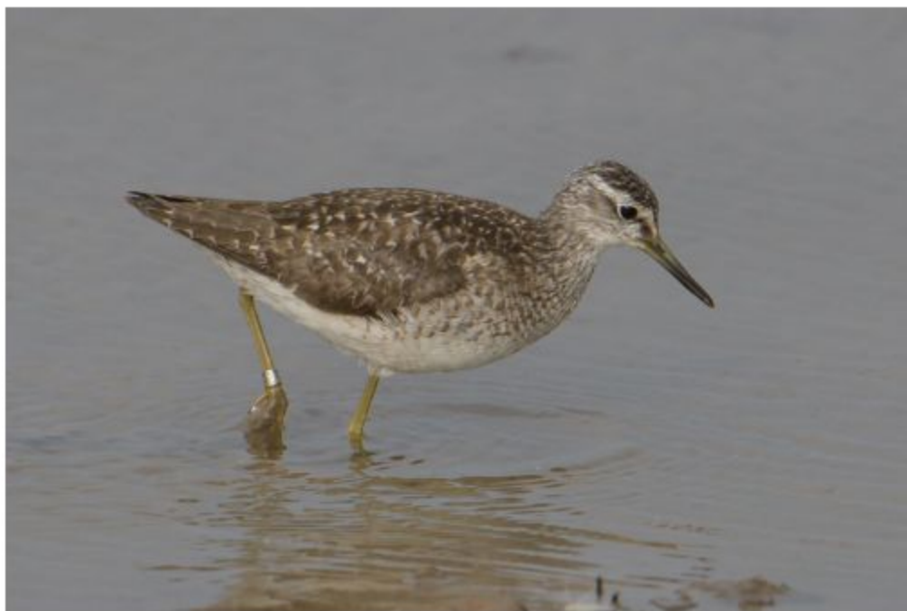
Ringed Wood Sandpiper