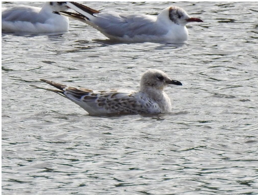
Mediterranean Gull at Boultham Mere