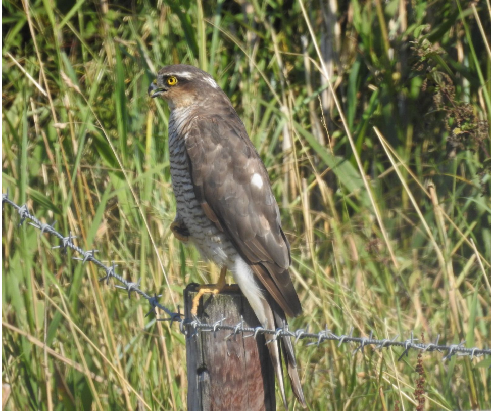
Sparrowhawk at Anderby

Pied Flycatcher, 2 Little Gull, Mediterranean Gull, Hobby, Arctic Tern, 25 Common Scoter, Great Skua, Sparrowhawk, Black Tern, 150 Sandwich Tern, 20 Yellow Wagtail