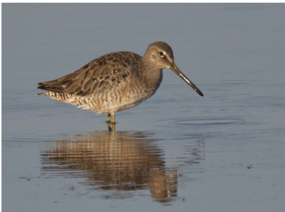
Long-billed Dowitcher showing well, Frampton Marsh - Image © Paul Sullivan