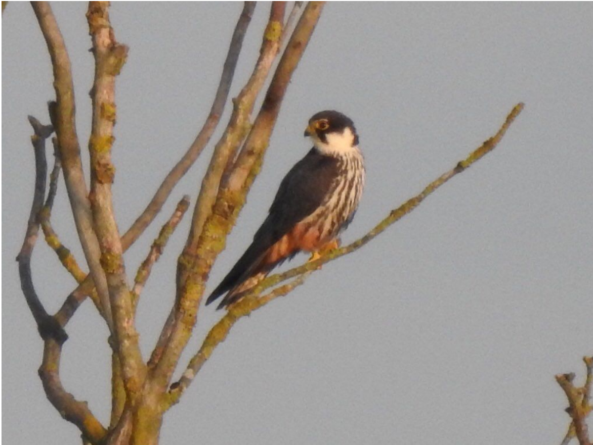
Hobby in Swanpool cow-fields