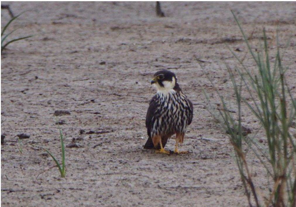
Hobby - Frampton Marsh

3 Pink-footed Geese, Hen Harrier, Marsh Harrier