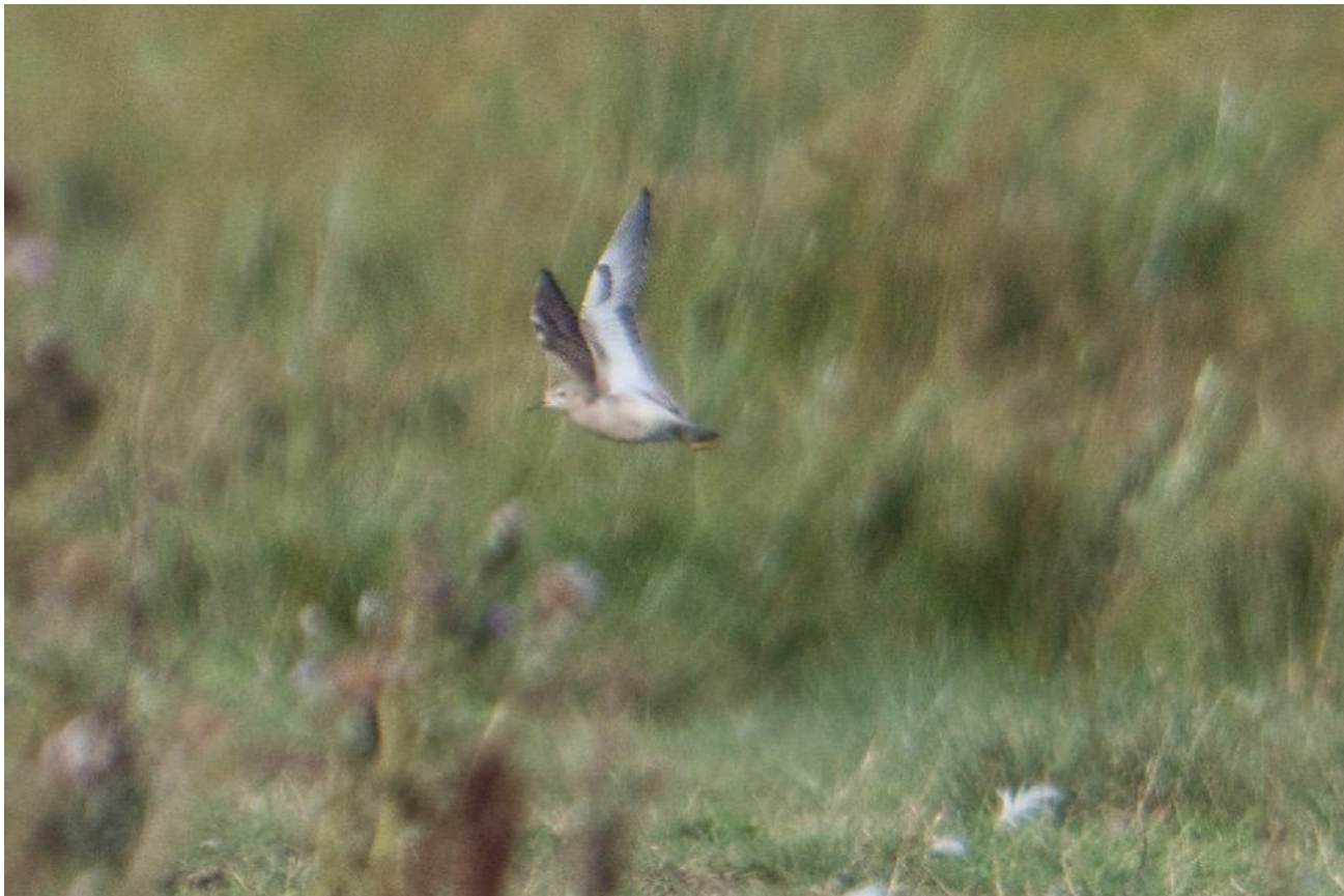
Buff-breasted Sandpiper heavily cropped - Image © Steve Keightley

7 Garganey, Long-billed Dowitcher, Nightjar being pursued by a Sparrowhawk, 11 Spotted Redshank, Buff-breasted Sandpiper, 4 Wood Sandpiper, 13 Spoonbill