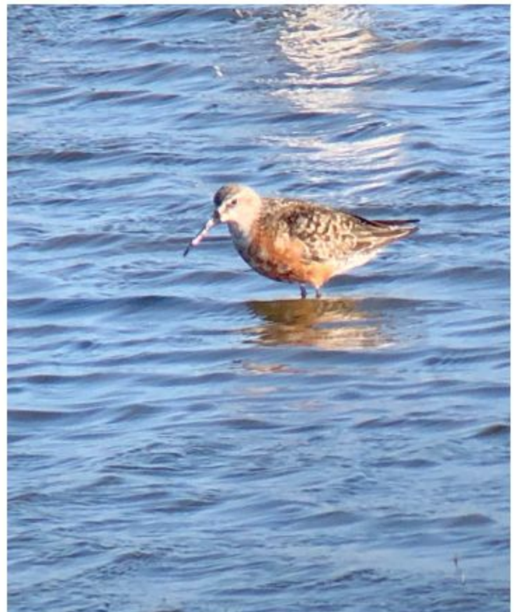
Long-billed Dowitcher - Image © Steve Keightley

Mediterranean Gull, 9 Greenshank, Marsh Harrier, 311 Sandwich Tern, Little Ringed Plover Common Sandpiper, Wood Sandpiper, 2 Short-eared Owl, 13 Shoveler, Sparrowhawk, 15 Spoonbill, 7 Spotted Redshank,