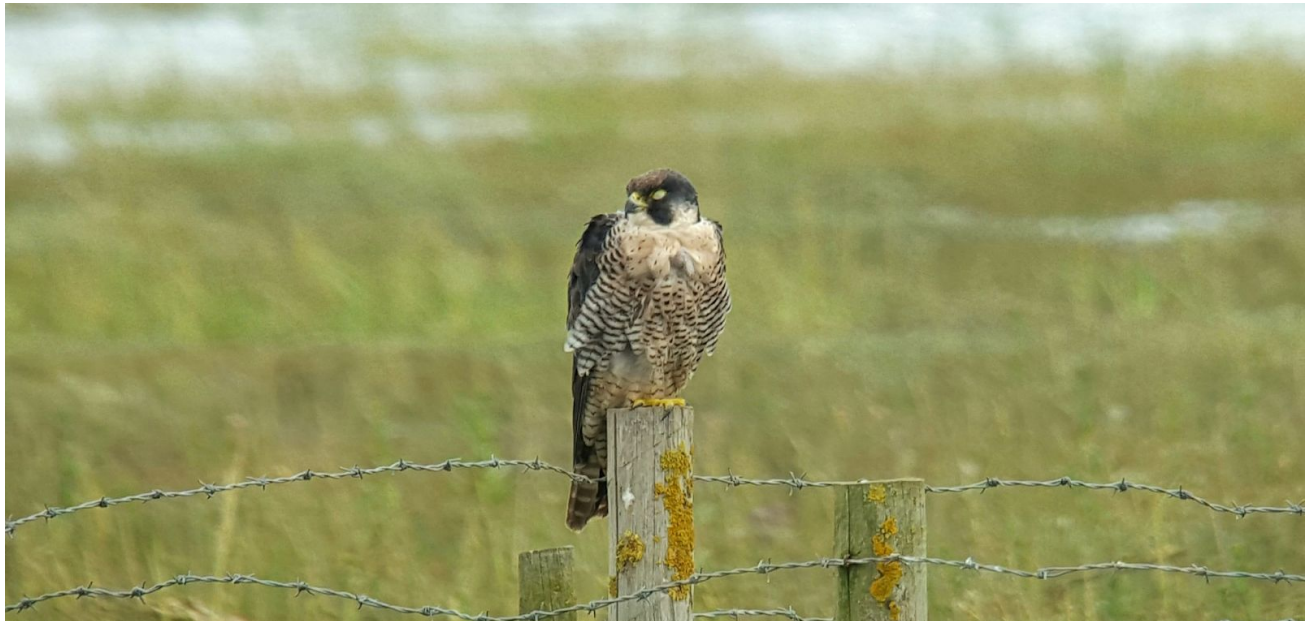
Peregrine Falcon

c50 Little Egrets, Eider, 2 White-rumped Sandpiper , 20 Wood Sandpiper, 3 Curlew Sandpiper, c50 Yellow Wagtail, 4 Wheatear,, Peregrine Falcon