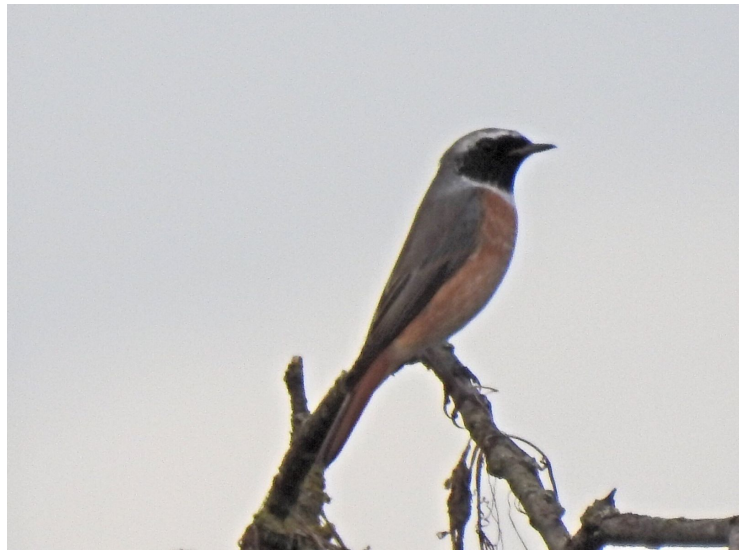
Common Redstart (male & female, Boultham cow-fields)