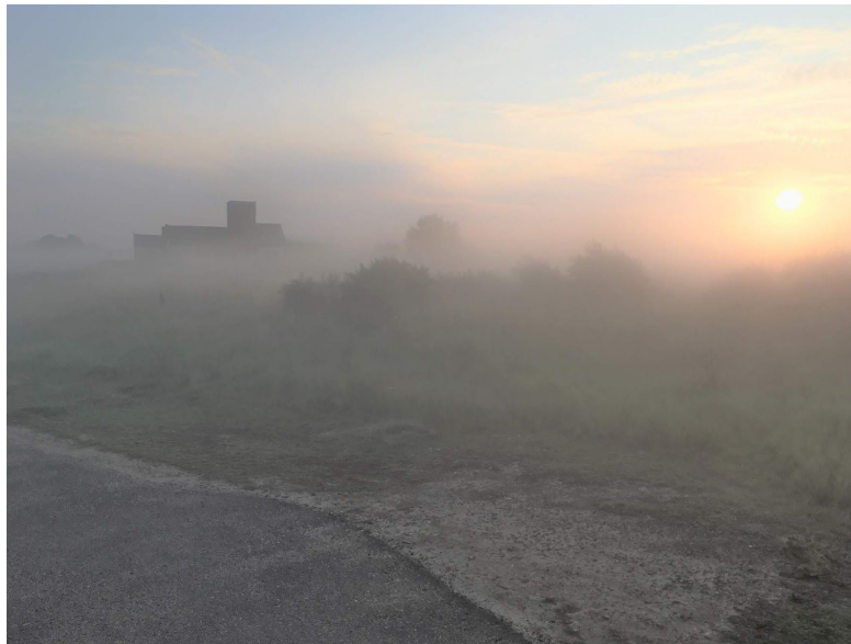
Fabulous early morning photo of the visitor centre at Gibraltar Point - Image © Ben Ward

3 Buzzard, 11 Little Egret, 17 Pied Flycatcher, 5 Greenshank, Marsh Harrier, Hobby, 2 Tawny Owl, Short-eared Owl, Spotted Redshank, 4 Snipe, 700 Sandwich Tern, 2 Stonechat, Treecreeper, Garden Warbler, Grasshopper Warbler, 13 Whinchat, Wheatear, 4 Whimbrel, 53 Common Whitethroat, 8 Lesser Whitethroat, Green Woodpecker,