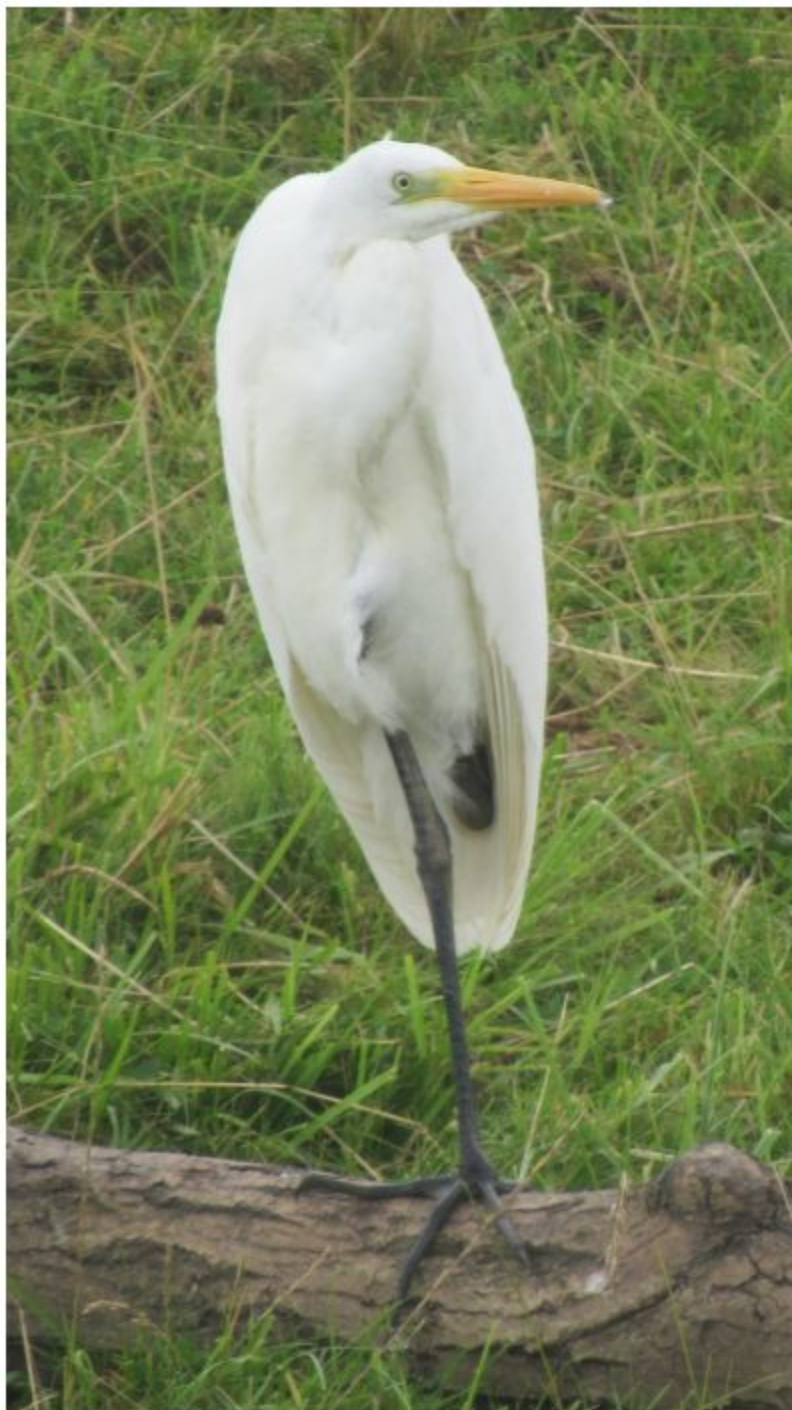
Great White Egret