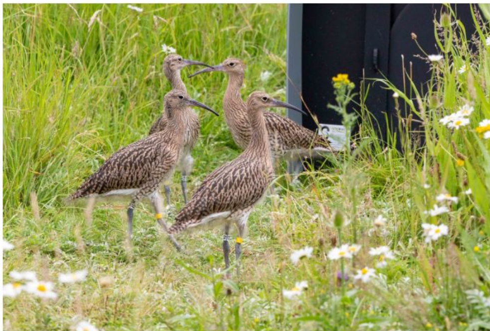
Each Eurasian Curlew has been fitted with a yellow ring on the right tibia and a white ring on the left tibia, with an engraved number between 01 and 99.

In order to learn more about the lives of Eurasian Curlews breeding in lowland England, a smaller number of wild birds (adults and chicks) have also been colour-ringed in Gloucestershire and Worcestershire, with sightings already received of these birds from the Camel Estuary in Cornwall. Each bird has been fitted with a yellow ring on the right tibia and a white ring on the left tibia, with an engraved number between 01 and 99 (reading up the leg).