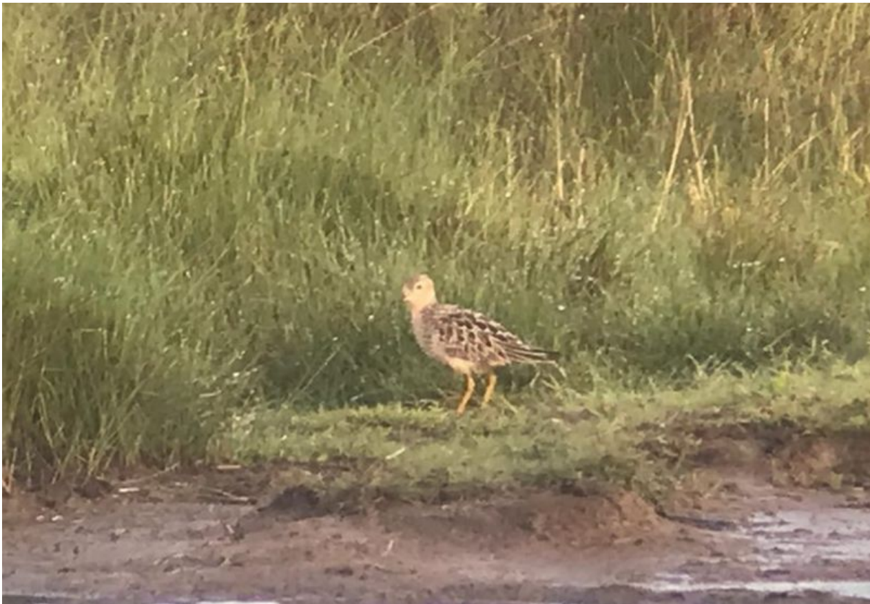
Buff-breasted Sandpiper at RSPB Frampton Marsh.