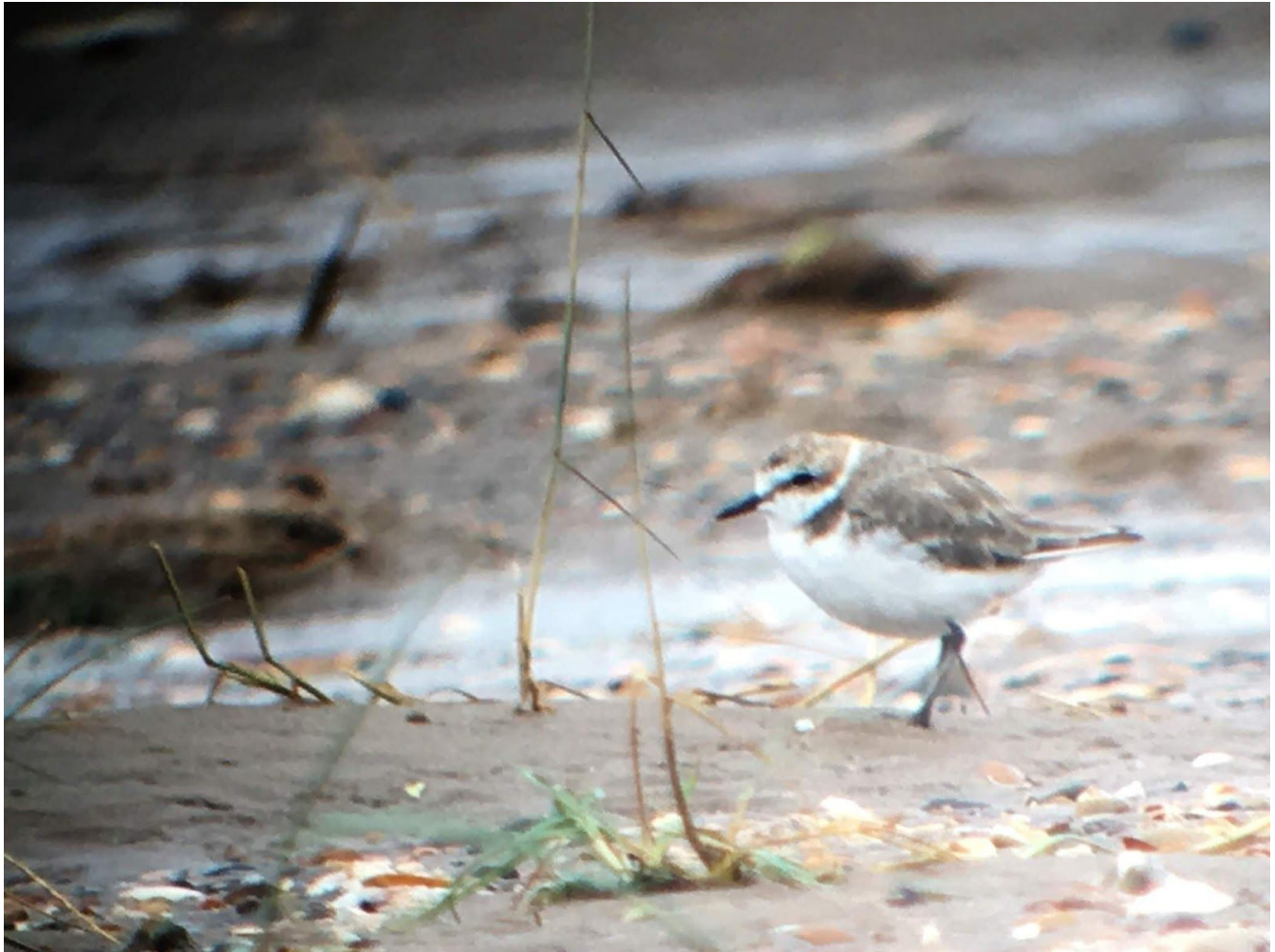
Female type Kentish Plover, Gibraltar Point

White-rumped Sandpiper, 16 Wood Sandpiper