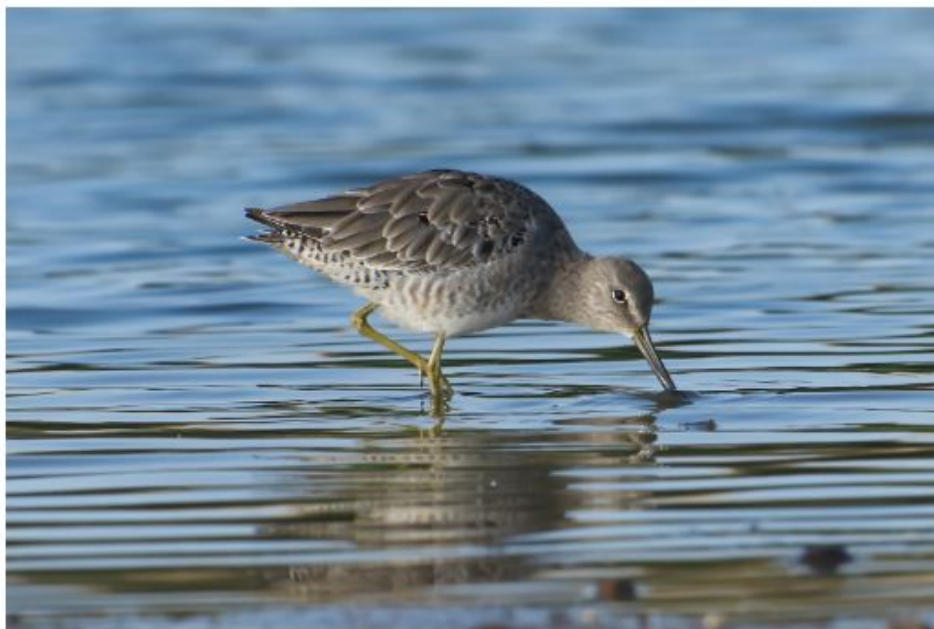
Fabulous shot of the Long-billed Dowitcher at Frampton Marsh

Mediterranean Gull. Birds around, including those trapped, were 4 Wigeon, 4 Gadwall, 59 Teal, 53 Shoveler, 16 Tufted Duck, a Grey Heron, 16 Spoonbill, a Red Kite, a Sparrowhawk, 2 Buzzard, a Green Sandpiper, 24 Greenshank, 4 Snipe, 850 Sandwich Tern, 26 Common Tern, an Arctic Tern, 2 Stock Dove, 2 Tawny Owl, a Short-eared Owl, a Kingfisher, a Peregrine, a Goldcrest, 6 Chiffchaff, 40 Willow Warbler, 8 Blackcap, 11 Lesser Whitethroat, 31 Whitethroat, 2 Treecreeper,