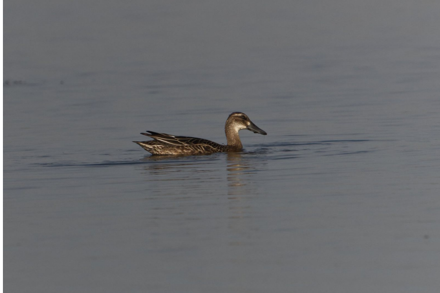
Garganey, Frampton Marsh

Long-billed Dowitcher, Egyptian Goose, Garganey, Hobby, Broad-billed Sandpiper, 14 Spotted Redshank, Greenshank, Golden Plover, 12 Golden Plover, Water Rail, 5 Curlew Sandpiper, Common Sandpiper, Green Sandpiper, 3 Wood Sandpiper, 19 Spoonbill, Little Stint, Turnstone, Turtle Dove, Stonechat, Whinchat, 3 Wood Sandpiper