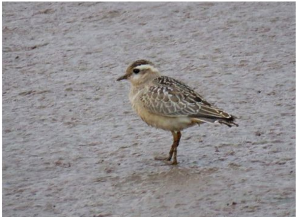
Dotterel at Killingholme

Long-billed Dowitcher, 2 Great White Egret, 2 Garganey, 16 Spotted Redshank, Buff-breasted Sandpiper, Common Sandpiper, Curlew