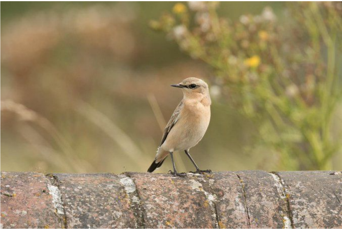
One of the wheatears present near the Visitor Centre at Gib Point