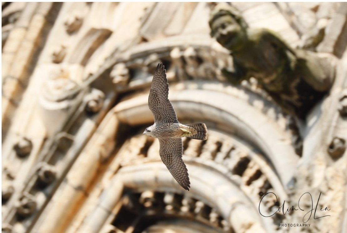
Juvenile Peregrine at Lincoln Cathedral