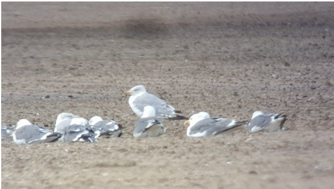
Yellow-legged Gulls