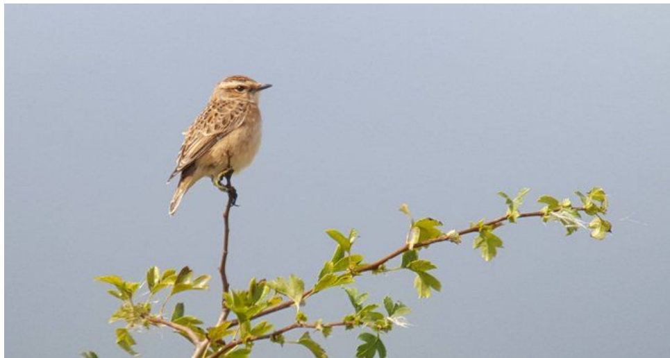
Whinchat down towards the Prison, Freiston Shore