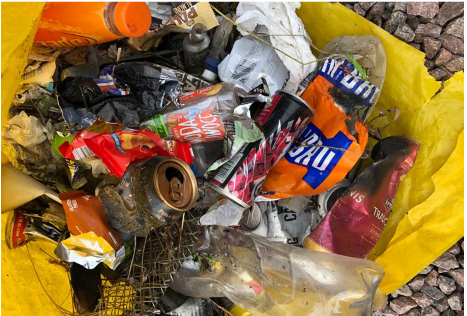
A photo of the Cut End Hide rubbish!

We would like to encourage members/visitors to take rubbish home with them as getting rubbish from hide to car park in any quantity is problematic without gate keys.