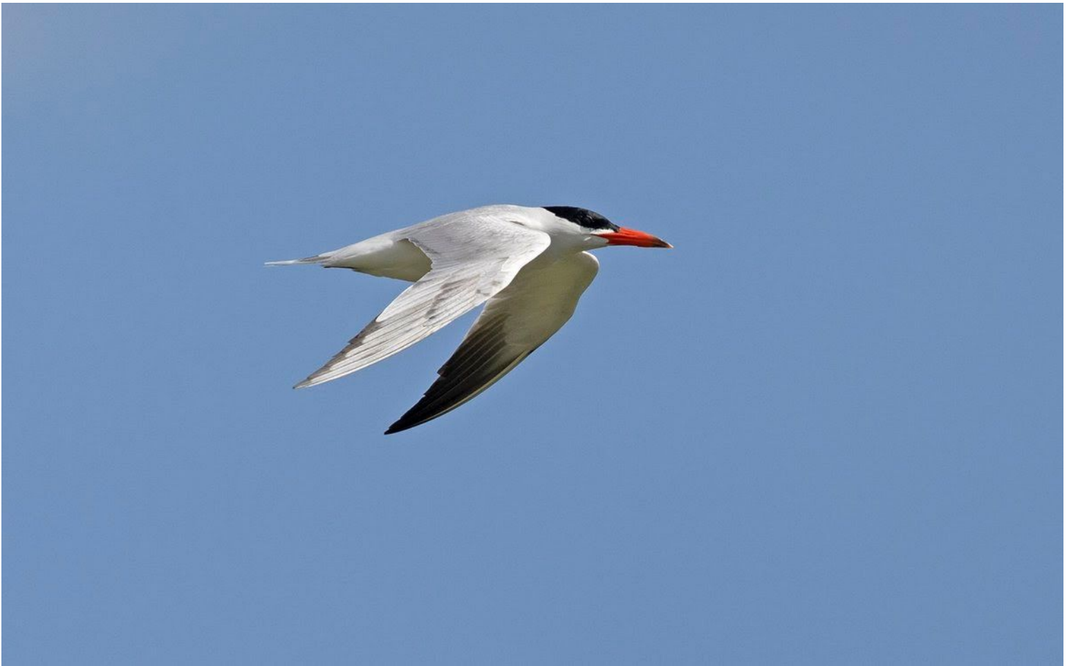
A superb shot of the Caspian Tern at Frampton Marsh - Image © Graham Catley