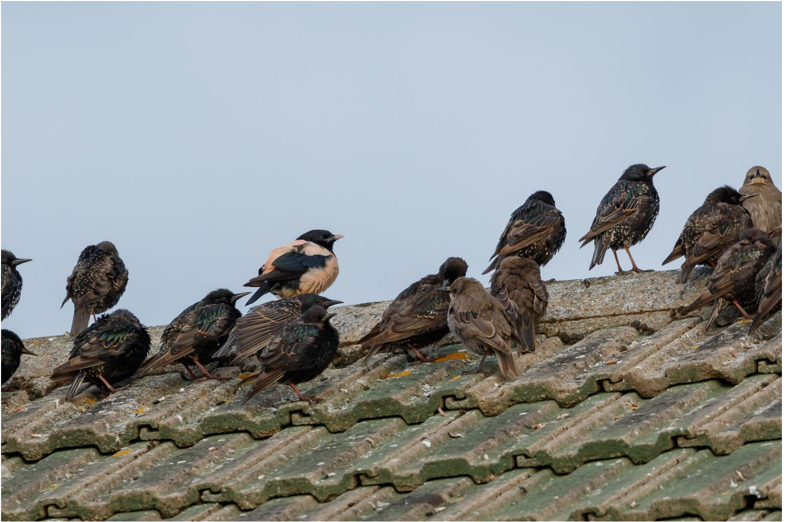
Rosy Starling at Mablethorpe 11th July 2020