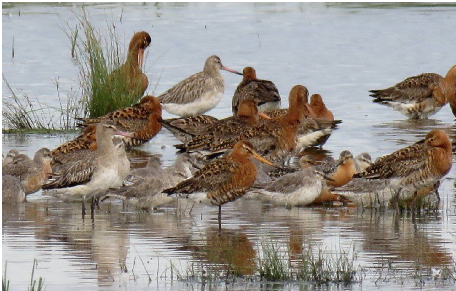
Black-tailed Godwit, Bar-tailed Godwit and Knot at RSPB Frampton 8th July 2020