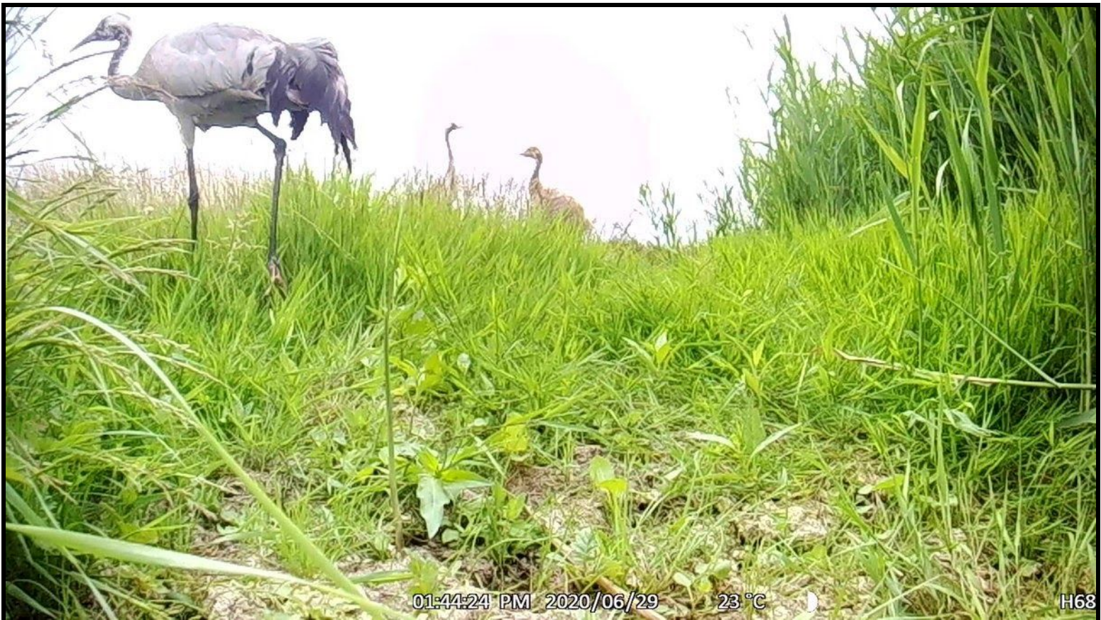
Common Crane with juvenile at Willow Tree Fen