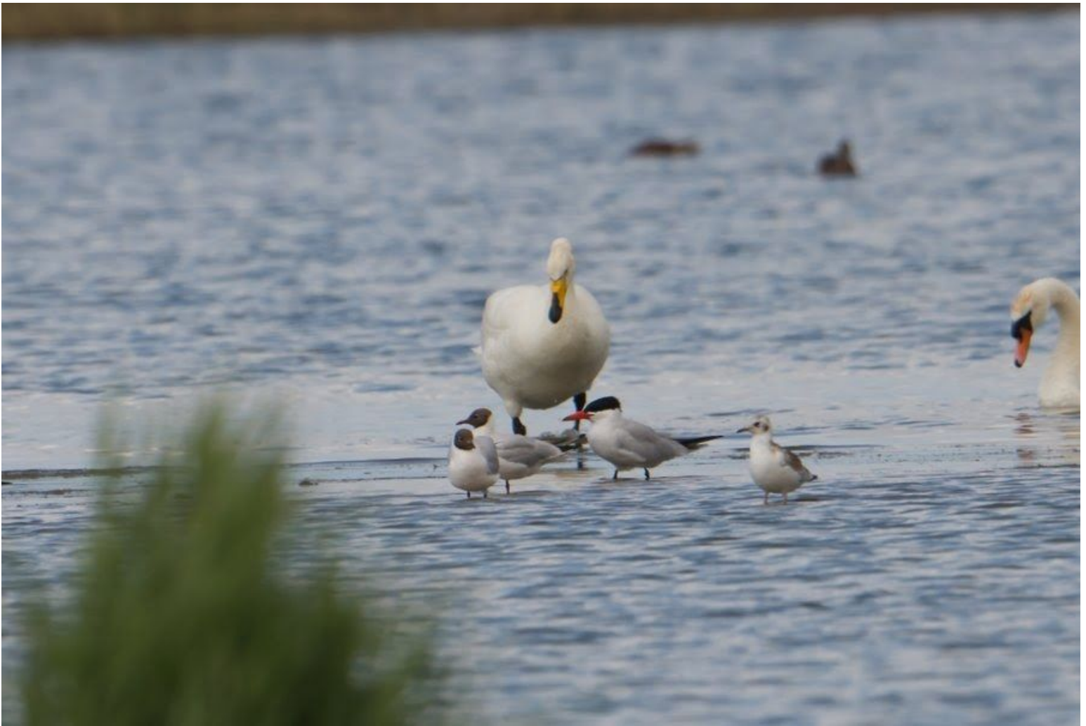
Unusual sighting together Whooper Swan and Caspian Tern at Frampton Marsh