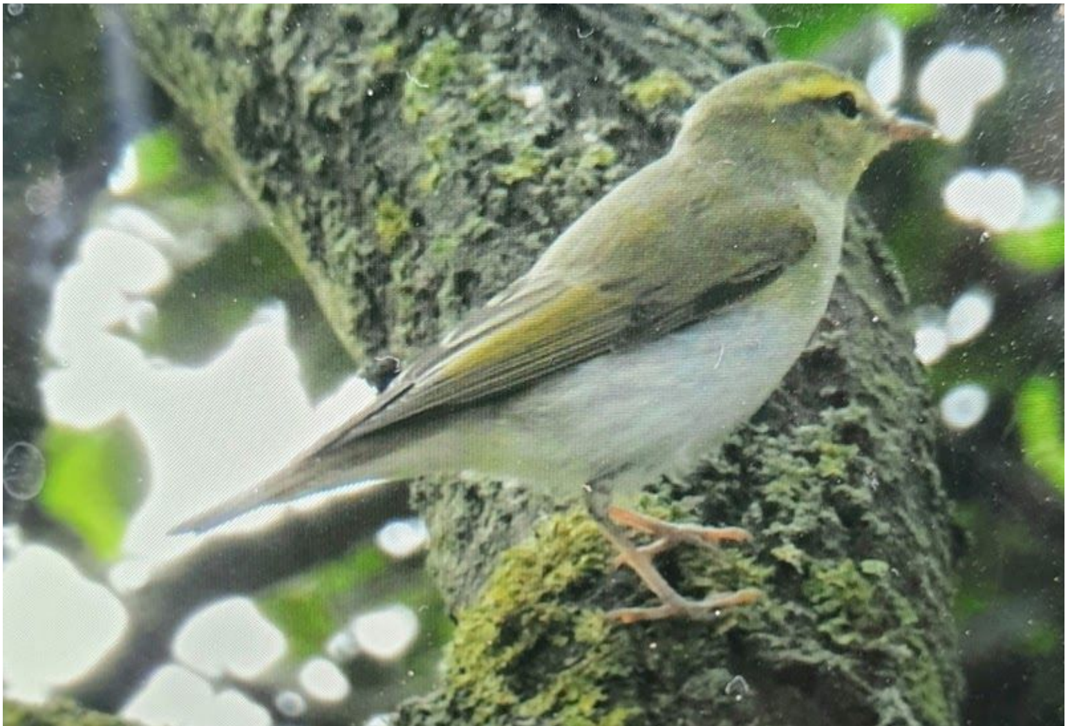
Wood Warbler at Gibraltar Point

4 Pied Flycatcher, Osprey, Common Redstart, Wood Sandpiper, Wood Warbler