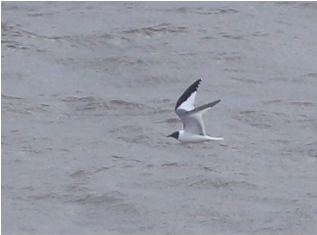
Sabine's Gull Huttoft 29th August 2020