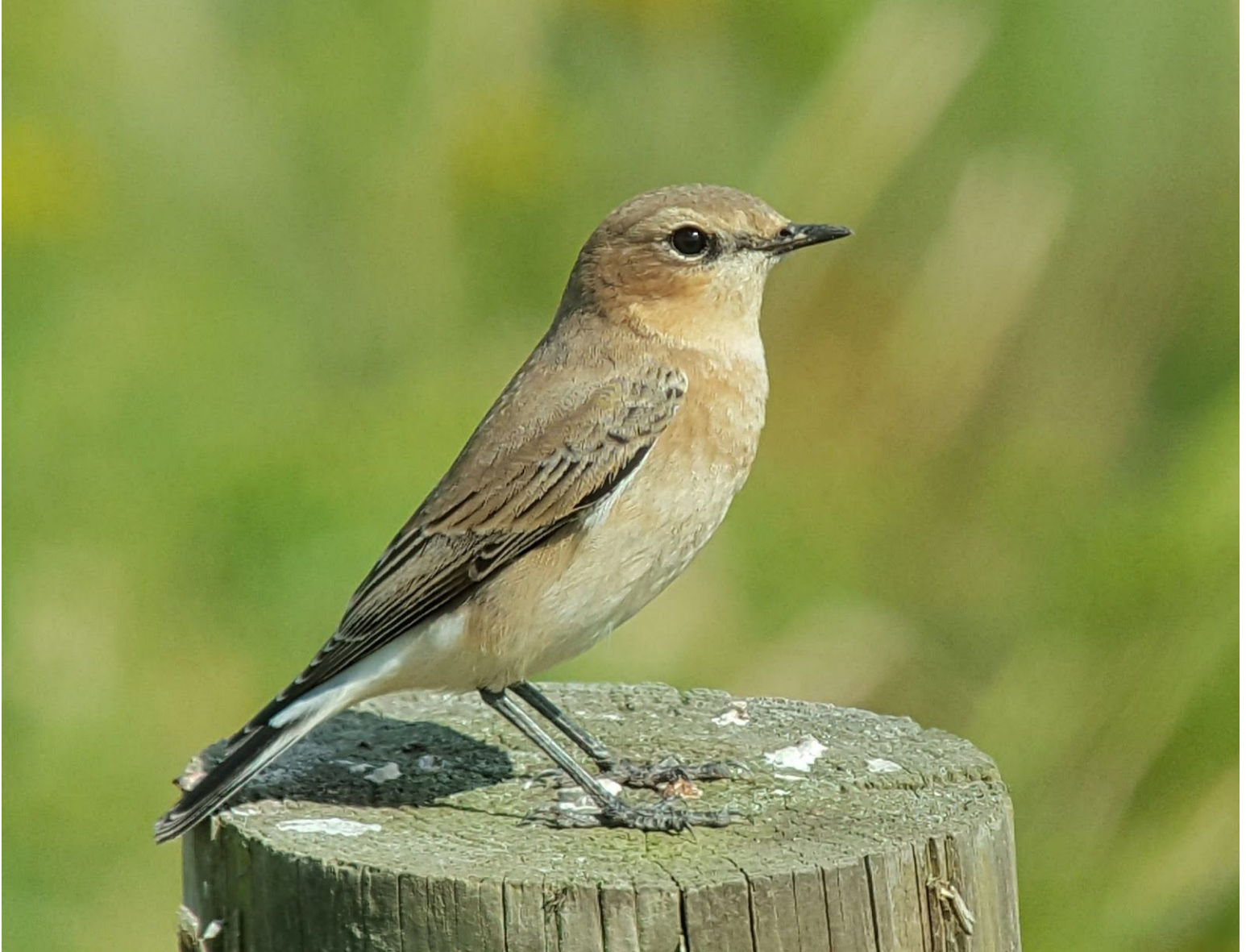
Northern Wheatear, Freiston Shore

Blackcap, 3 Corn Bunting, 35 Eider, 3 Little Tern, Yellow Wagtail, 10 Whinchat, Wheatear, 20 Willow Warbler, 5 Lesser Whitethroat