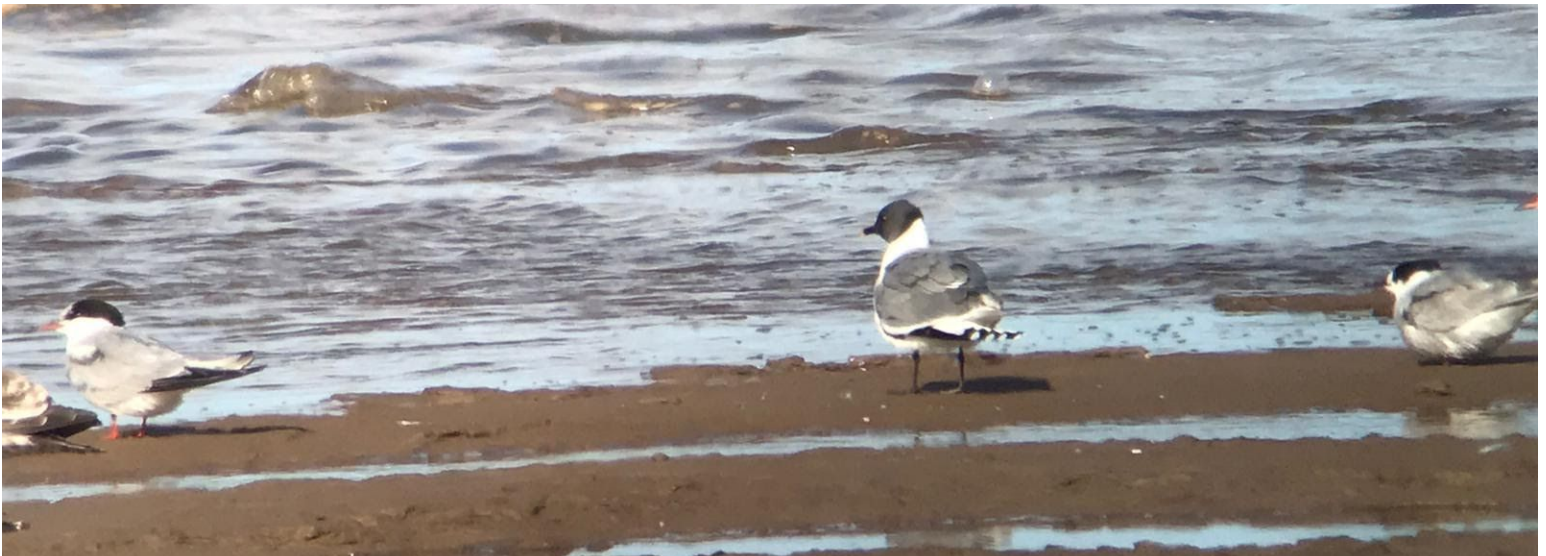
Sabine's Gull at Cut End

2 Sabine's Gull (reported), 3 Black Tern