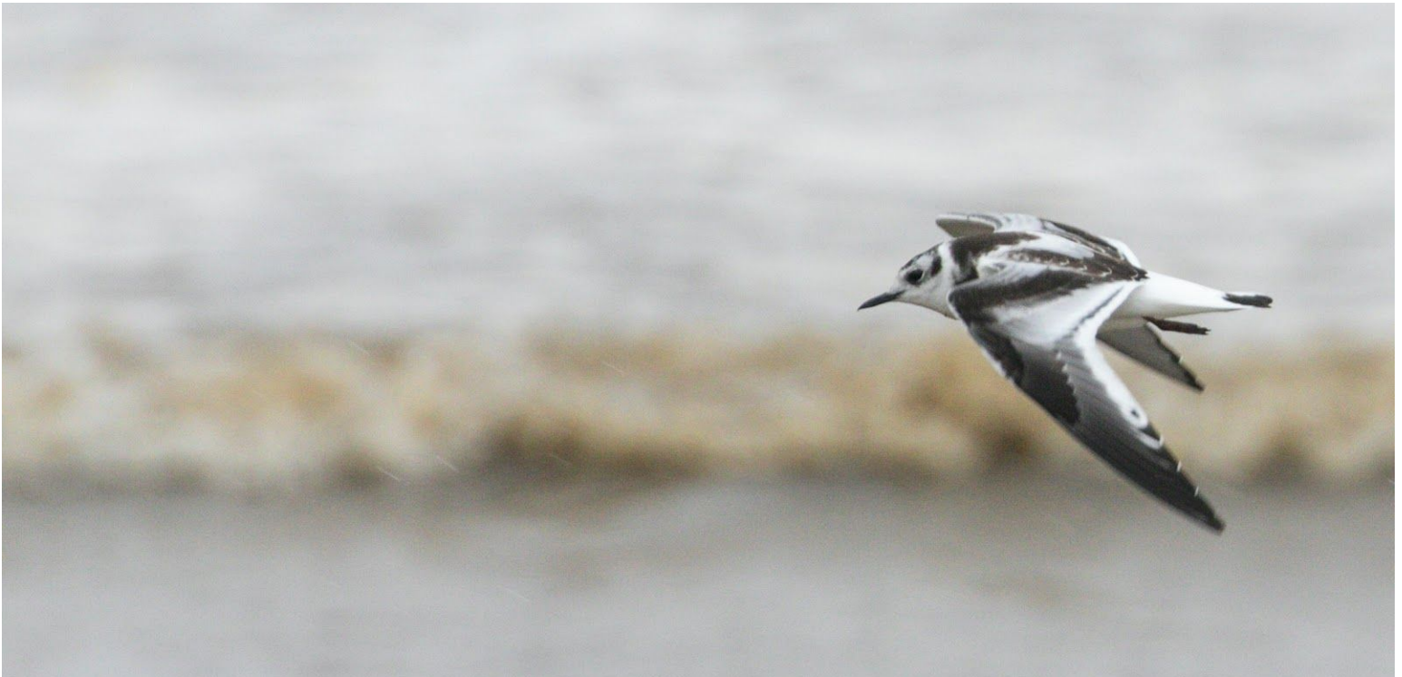
Little Gull (juvenile) at Huttoft around mid-day