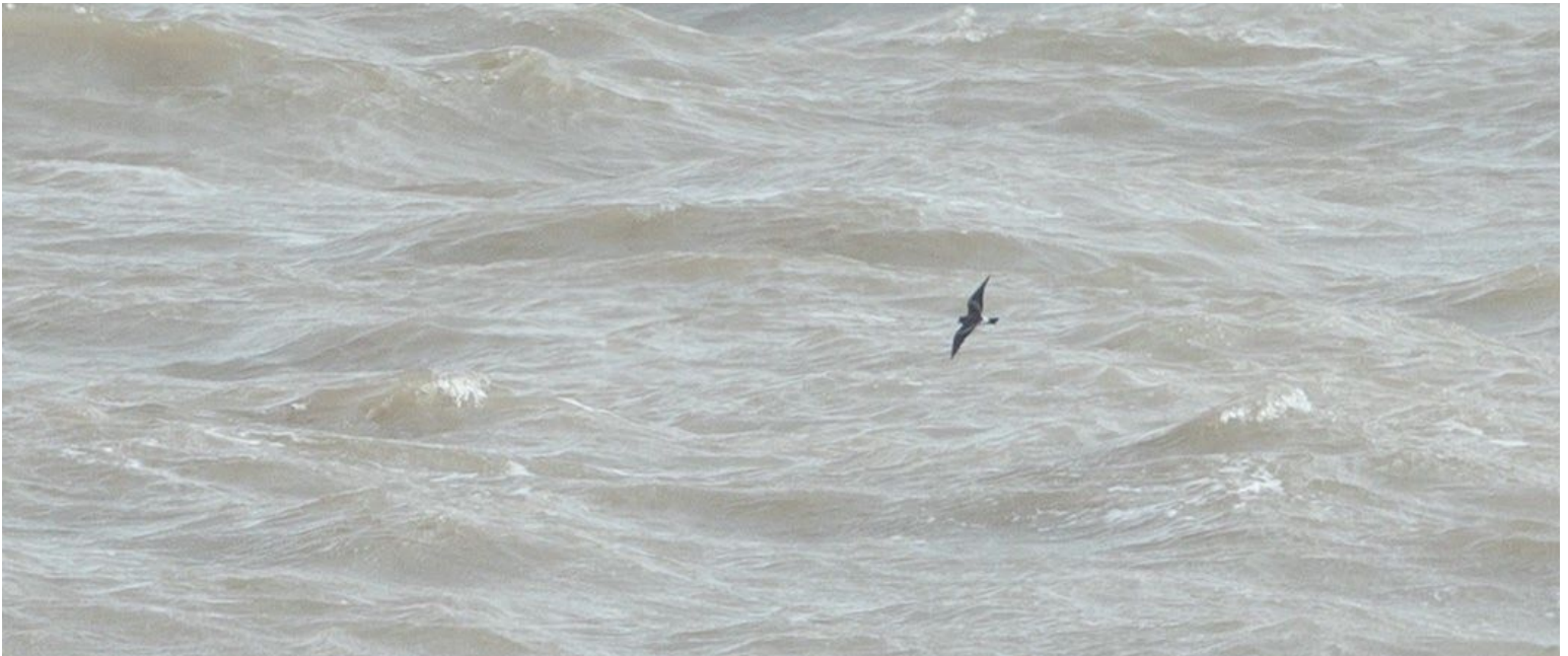
Leach's Storm Petrel off Huttoft Car Terrace