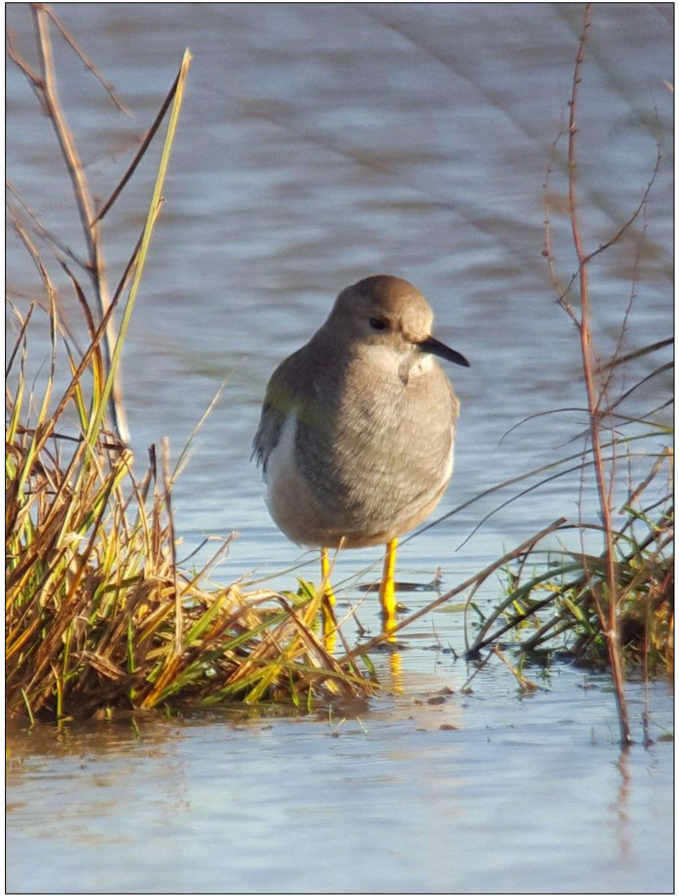
A nice shot of a Lincolnshire first at East Halton