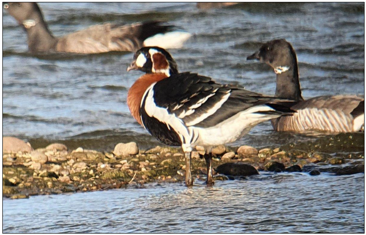
After going missing for a few days the Red-breasted Goose put in an appearance at Gibraltar Point

27/01/2022 Baston Fen Kestrel, Green Woodpecker Baston & Langtoft Pits Ring-necked Duck Deeping Lakes Goosander (f), Little Owl, Long-eared Owl Deeping High Bank Pair of Goosander Gibraltar Point 17 Snow Bunting, Red-breasted Goose