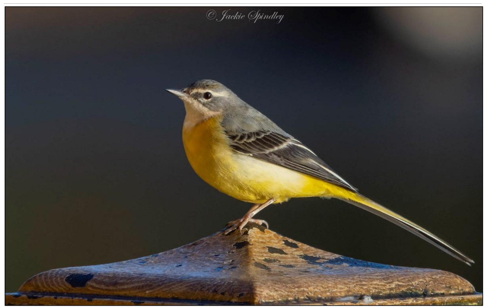
An excellent photo of a Grey Wagtail at Belton House - Image © Jackie Spindley

Boultham Mere 4 Bullfinch, 19 Grey Partridge, 80 Redwing, Cetti's Warbler Deeping Lakes Russian White-fronted Goose East Halton Cattle Egret, Short-eared Owl, Water Pipit, White-tailed Plover, Redshank, 2 Stonechat Lincs Wolds 16 Red Kite Marston Siberian Chiffchaff Norton Disney 4 Whooper Swan Tallington Lakes Ring-necked Duck, Greater Scaup, European Shag Tetney Lock Great White Egret