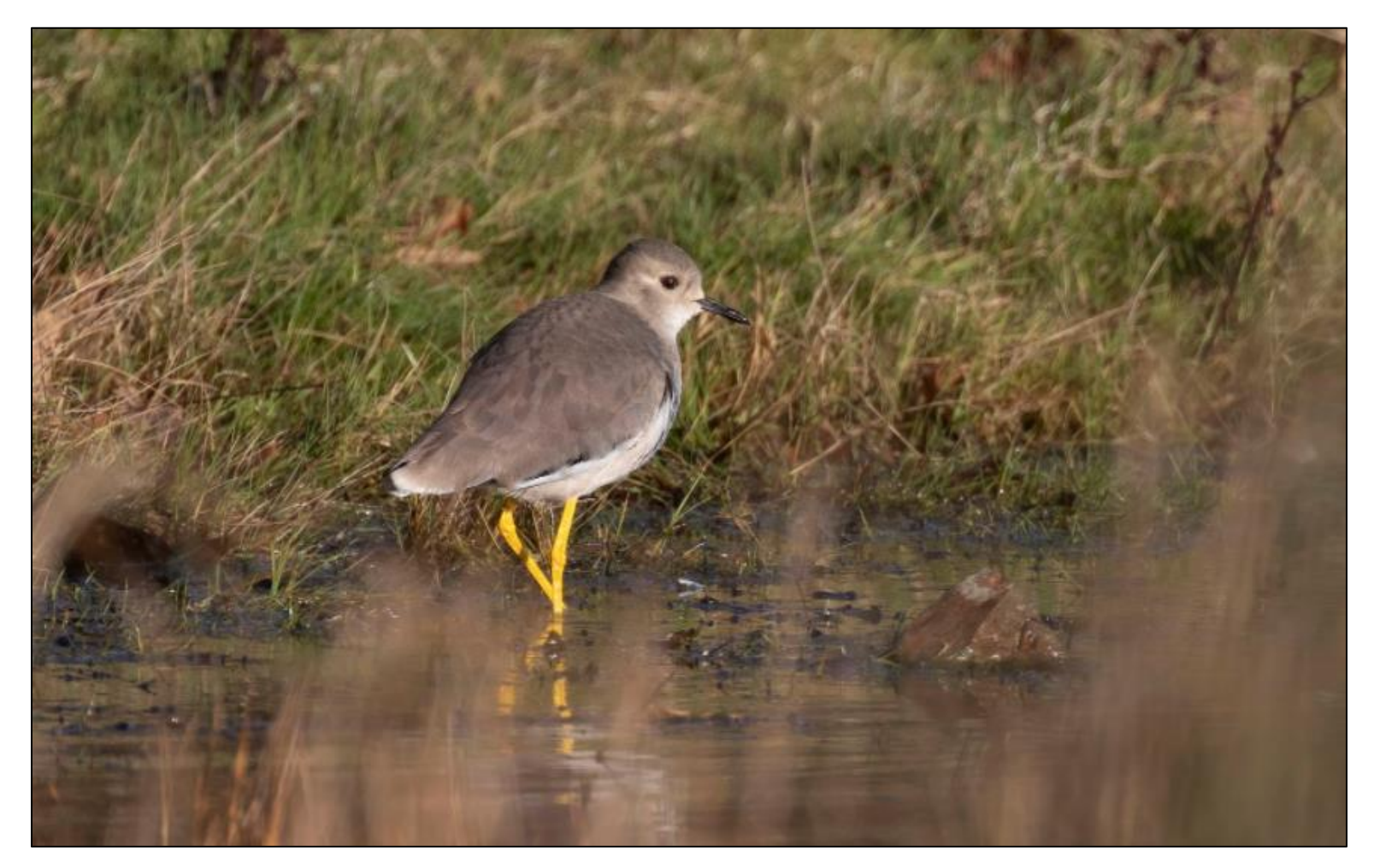
White-winged Plover at East Halton

01/01/2022 Deeping Lakes Cattle Egret Denton Brambling, Goosander Frampton Marsh Richard's Pipit East Halton Cattle Egret, 9 Little Egret, Kestrel, White-winged Plover (53 40 38.87 0 15 31.35 W) Far Ings Reed Bunting, Gadwall, Goldeneye, 30 Goldfinch, 3 Kestrel, 20 Siskin, Bearded Tit, Cetti's Warbler Mablethorpe 5 Long-tailed Duck, 8 Velvet Scoter Tallington Lakes Ring-necked Duck, Greater Scaup, European Shag Trent Port Bullfinch, Goldcrest, Goosander, Grey Partridge, Red-legged Partridge, 2 Sparrowhawk, Mistle Thrush Treecreeper, Grey Wagtail Whisby Great White Egret