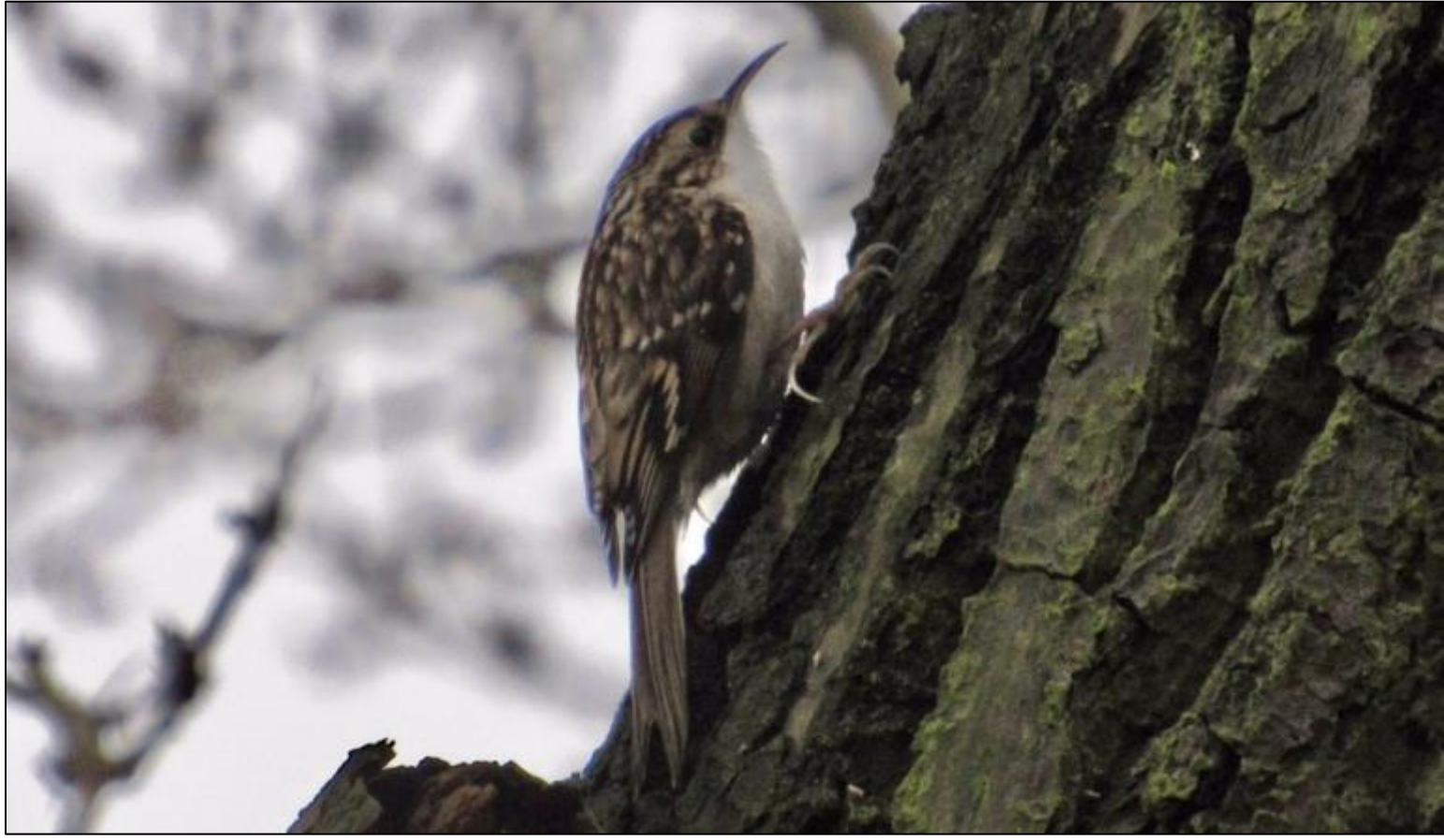
Treecreeper, Whisby

31/01/2022 Deeping Lakes Long-eared Owl Frampton Marsh 12 Corn Bunting, Red-throated Diver, 6 Little Egret, Marsh Harrier, 6 Red-breasted Merganser, Merlin, 71 Whooper Swan Gibraltar Point Red-breasted Goose East Halton White-tailed Lapwing Whisby Treecreeper