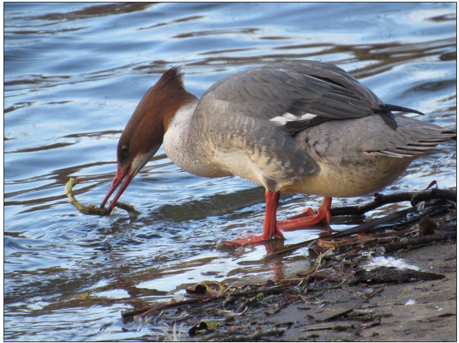
A pleasing close up of a female Goosander in Cleethorpes

20/01/2022 Butterwick Low Red-breasted Goose Cleethorpes 31 Snow Bunting