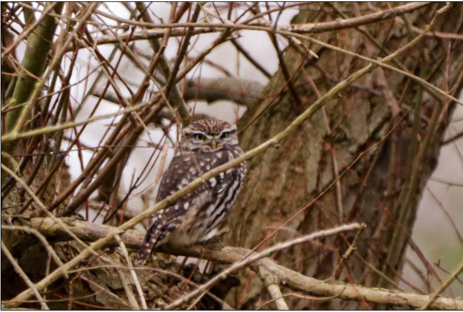
Little Owl close to Baston Fen

23/01/2022 Baston & Langtoft Pits Ring-necked Duck Deeping Lakes Long-eared Owl Frampton Marsh Short-eared Owl, 2 Hen Harrier (ring-tails), 5 Water Pipit, Little Stint Gibraltar Point Black-throated Diver East Halton Bar-tailed Godwit, 3 Little Owl, White-tailed Plover Langtoft Ring-necked Duck Marston 475 Carrion Crow Tongue End Catttle Egret Trent Port Bullfinch, Peregrine Falcon, Goldcrest, Sparrowhawk, Mistle & Song Thrush, Coal Tit, Great Spotted Woodpecker