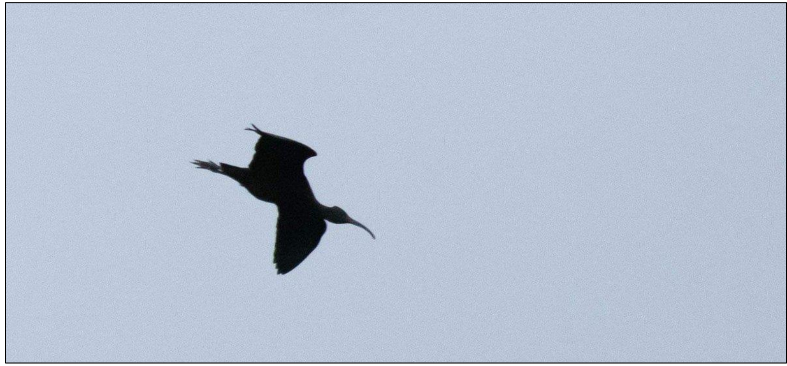
Glossy Ibis over Far Ings

29/01/2022 Baston & Langtoft Pits Ring-necked Duck Chowder Ness/Far Ings Glossy Ibis