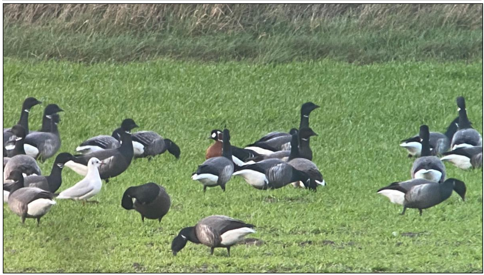
Red-breasted Goose to the north of the Butterwick car-park

Gibraltar Point Slavonian Grebe (S) Goxhill Cattle Egret East Halton White-tailed Plover Lincs Coastal Country Park Bittern, 13 Red-throated Diver, 2000 Pink-footed Goose, 5 White-fronted Goose, 400 Lapwing, Barn Owl, Short-eared Owl, Pintail, Eurasian Shag Mablethorpe 5 Long-tailed Duck, Purple Sandpiper, 4 Velvet Scoter Marston Siberian Chiffchaff South Hykeham 42 Fieldfare, 500 Pink-footed Goose, Little Owl, 2 Tawny Owl, 2 Snipe, Jack Snipe Trent Port 105 Fieldfare, 3 Goldcrest, 210 Pink-footed Goose, 2 Sparrowhawk, 22 Pied Wagtail 08/01/2022