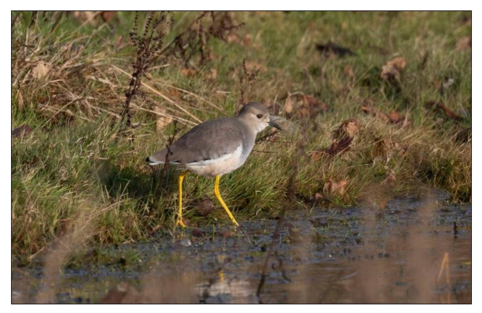
December 31st 2021 White-tailed Lapwing Vanellus leucurus at East Halton Pits

For more photographs see: <u>https://www.grahamcatley.com/rare-birds-in-britain/whitetailed-lapwing-east-halton-pits-december-31st-2021</u>