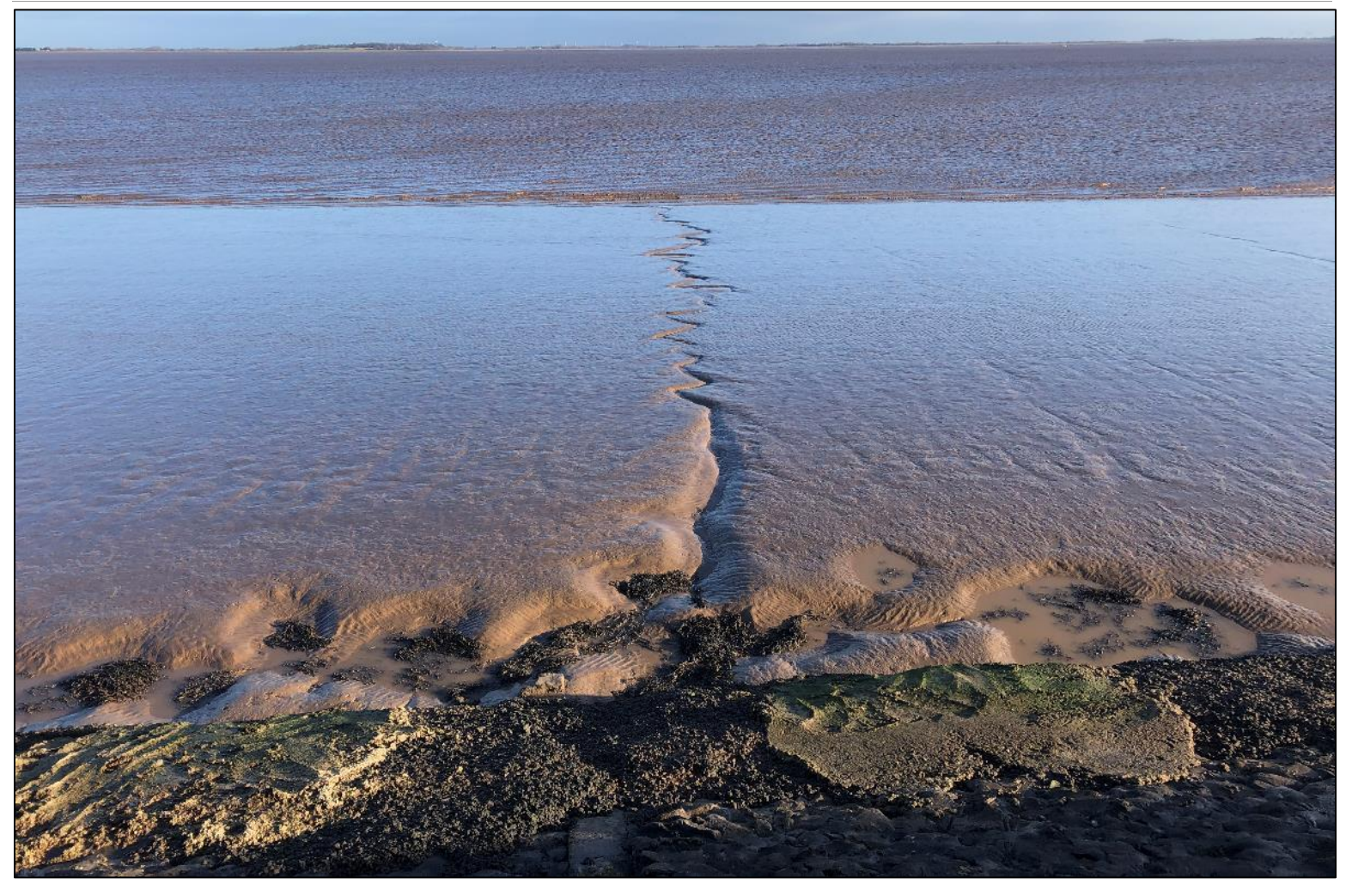
The Humber Estuary from East Halton Skitter January 2022