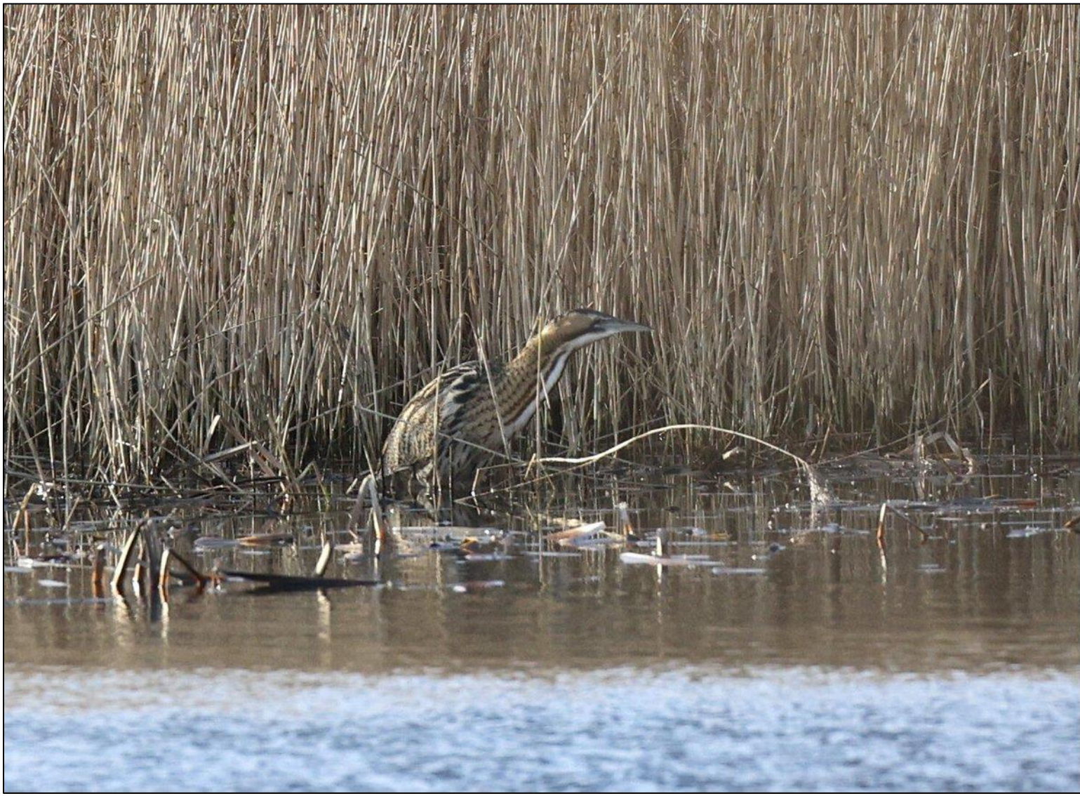
Splendid shot of the Bittern near Huttoft

Mablethorpe 5 Long-tailed Duck, 8 Velvet Scoter Trent Port, Marton 50 Chaffinch, Chiffchaff, Kingfisher, 12 Red-legged Partridge, Mistle Trush, 36 Wigeon Marston 2 Siberian Chiffchaff Millennium Green Chiffchaff, Pink-footed Geese, 2 Goldcrest, 16 Goldeneye, 5 Goosander (1 male), Kingfisher, Mandarin Duck, 6 Redwing, Tawny Owl, 33 Pochard, 2 Lesser Redpoll, 35 Siskin, Treecreeper Norton Disney Great White Egret Tallington Lakes Ring-necked Gull 02/02/2022 Baston & Langtoft Pits Ring-necked Duck