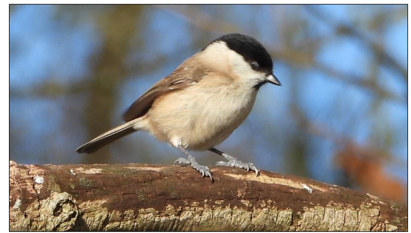
Marsh Tit in Neville Wood

Gibraltar Point 12 Snow Bunting, Great Northern Diver (N) East Halton Skitter White-tailed Lapwing (TA150216) Langtoft Ring Necked Duck Mablethorpe Slavonian Grebe, Purple Sandpiper, 60 Common Scoter, 7 Velvet Scoter Marston Siberian Chiffchaff Sutton on Sea Red-throated Diver, 16 Kittiwake Willow Tree Farm 8 Bewick's Swan, 45 Whooper Swan 19/01/2022 Butterwick Low Red-breasted Goose Deeping Lakes Long-eared Owl Far Ings Bittern Frampton Marsh Great White Egret, Merlin, Pintail, Golden Plover, Water Rail, Ruff, Little Stint, 43 Whooper Swan Gibraltar Point Hen Harrier (m) Irnham Red Kite, Raven Neville Wood Marsh Tit