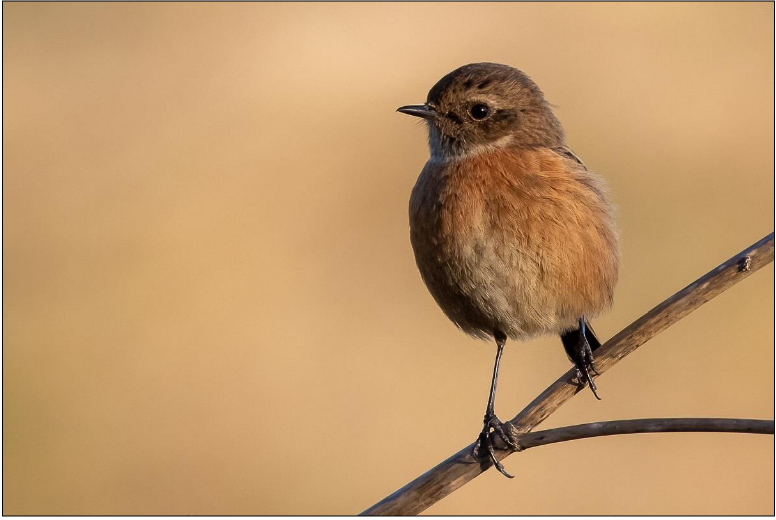
One of the two Stonechat at Marston

East Halton White-tailed Plover Frampton Marsh Great White Egret, Hen Harrier (male), Merlin, Whooper Swan Gibraltar Point 5 Snow Bunting Mablethorpe 5 Long-tailed Duck, 5+ Velvet Scoter Marston Siberian Chiffchaff (trapped & ringed), Goldfinch, Lesser Redpoll, 2 Stonechat