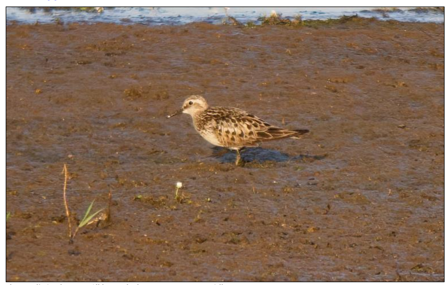
The Baird's Sandpiper at Alkborough Flats - Image © Wayne Gillatt

21/06/2022 Alkborough Flats Baird's Sandpiper