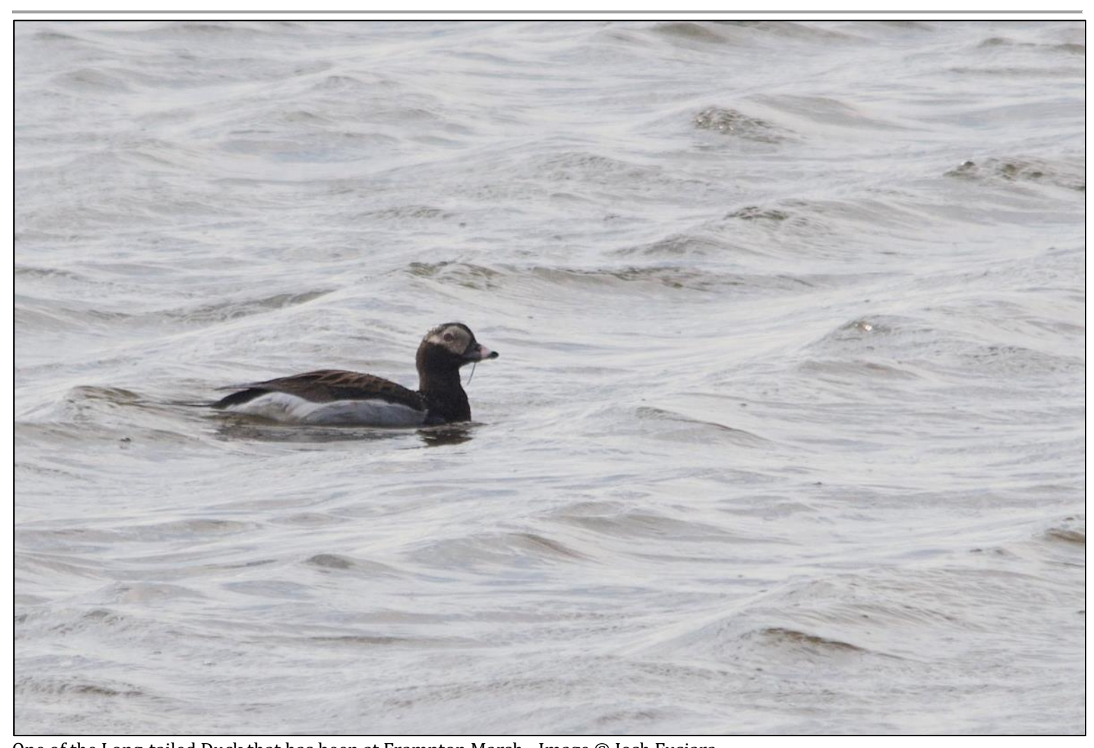
One of the Long-tailed Duck that has been at Frampton Marsh