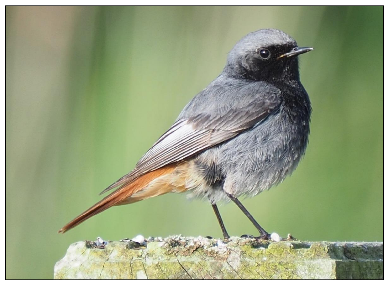
Black Redstat at Saltfleetby/ Theddlethorpe Dunes

Sea-View Farm Bee-eater Swanholme Lakes 4 Garden Wabler