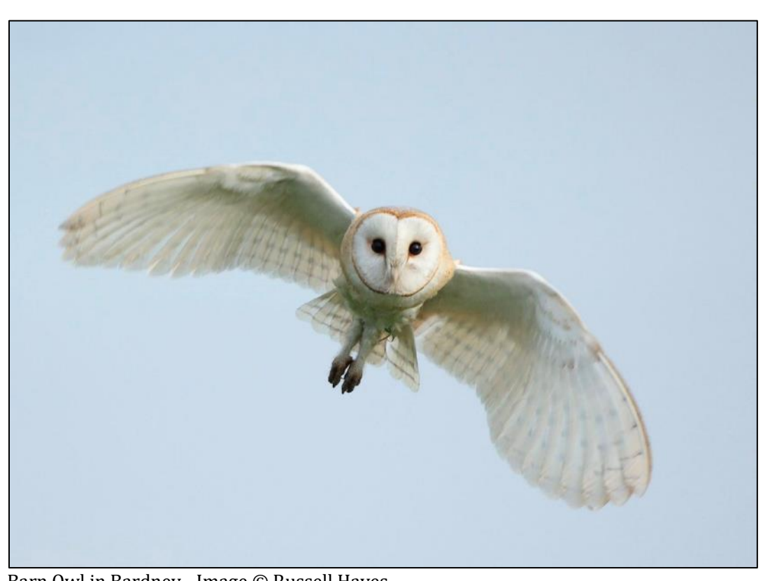
Barn Owl in Bardney