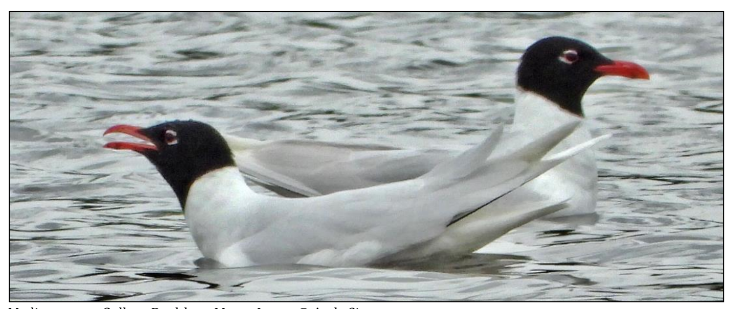
Mediterranean Gulls at Boultham Mere - Image © Andy Sims

27/06/2022 Boultham Mere 2 Mediterranean Gulls