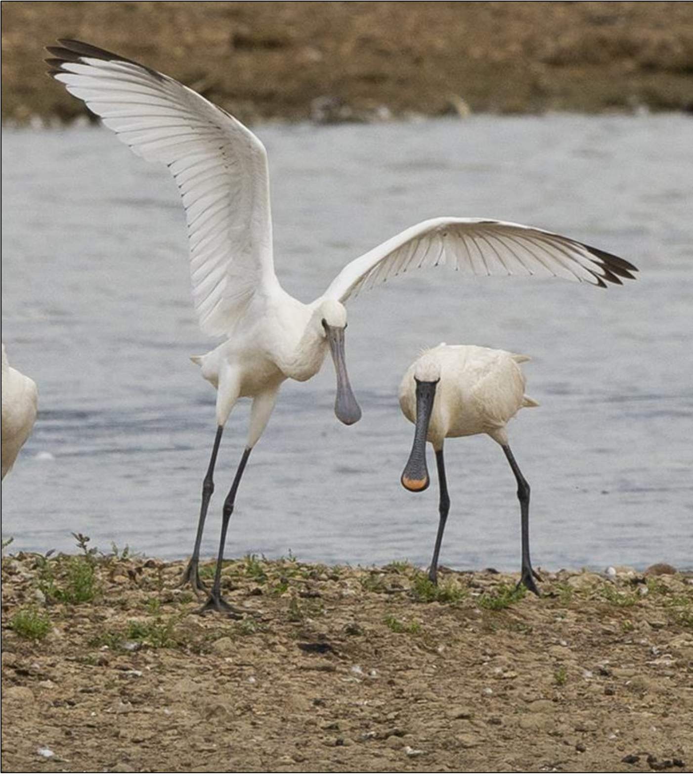
Splendid photo of the two wide awake Spoonbills at Deeping Lakes

Frampton Marsh 5 Spotted Redshank, 2 Curlew Sandpiper, 14 Spoonbill, Little Stint Gibraltar Point 3 Spoonbill Messingham