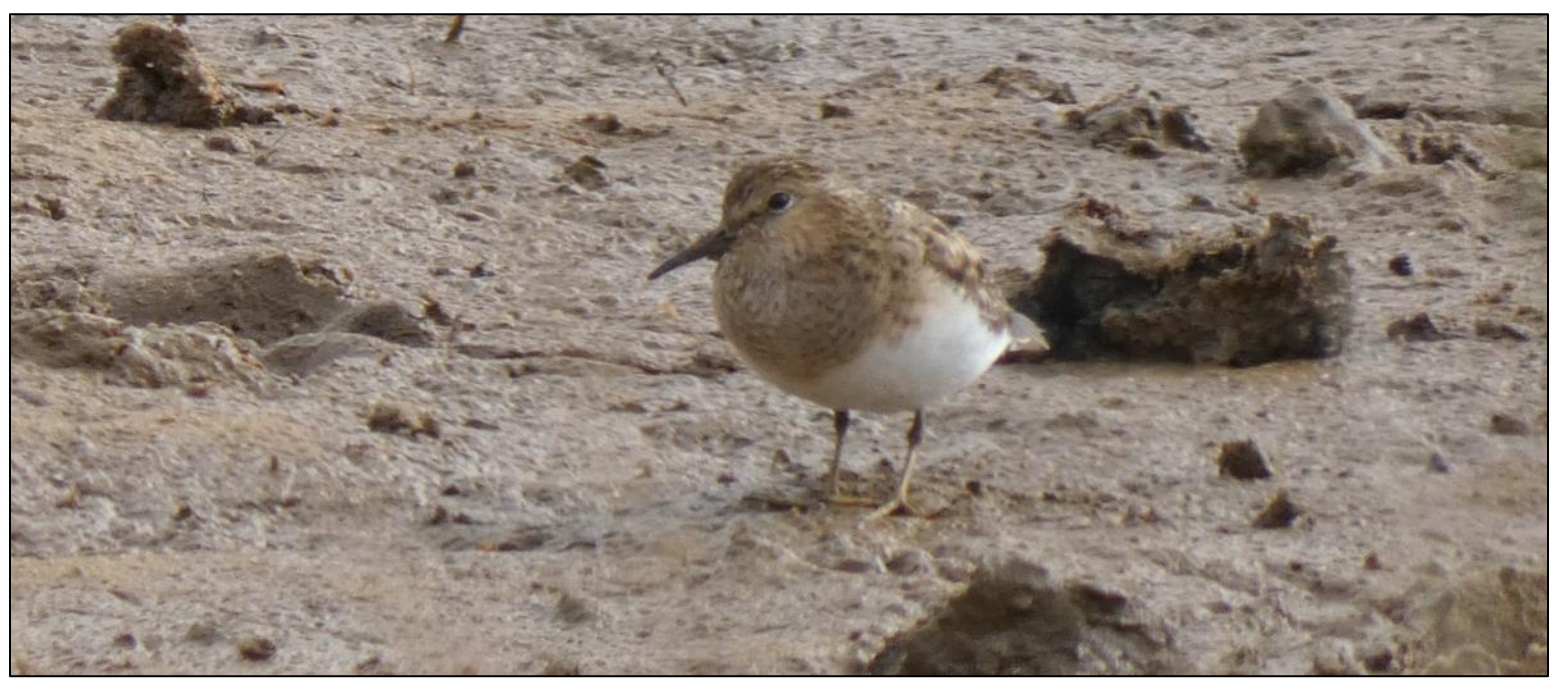
Temminck's Stint at Rimac

Willow Tree Fen 6 Common Crane (family group of four plus two interlopers)