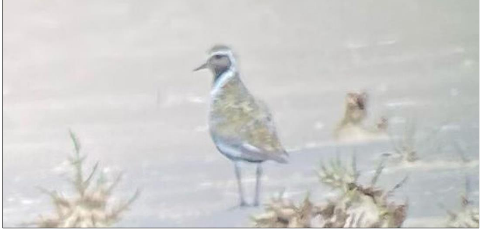
The possible Pacific Golden Plover that was at Saltfleetby this morning

Cuckoo, Short-eared Owl, Red Kite, Pacific Golden Plover (possible)