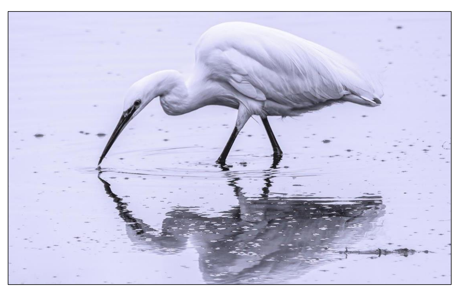
Little Egret at Gibraltar Point - Image © Jacqueline Spindley