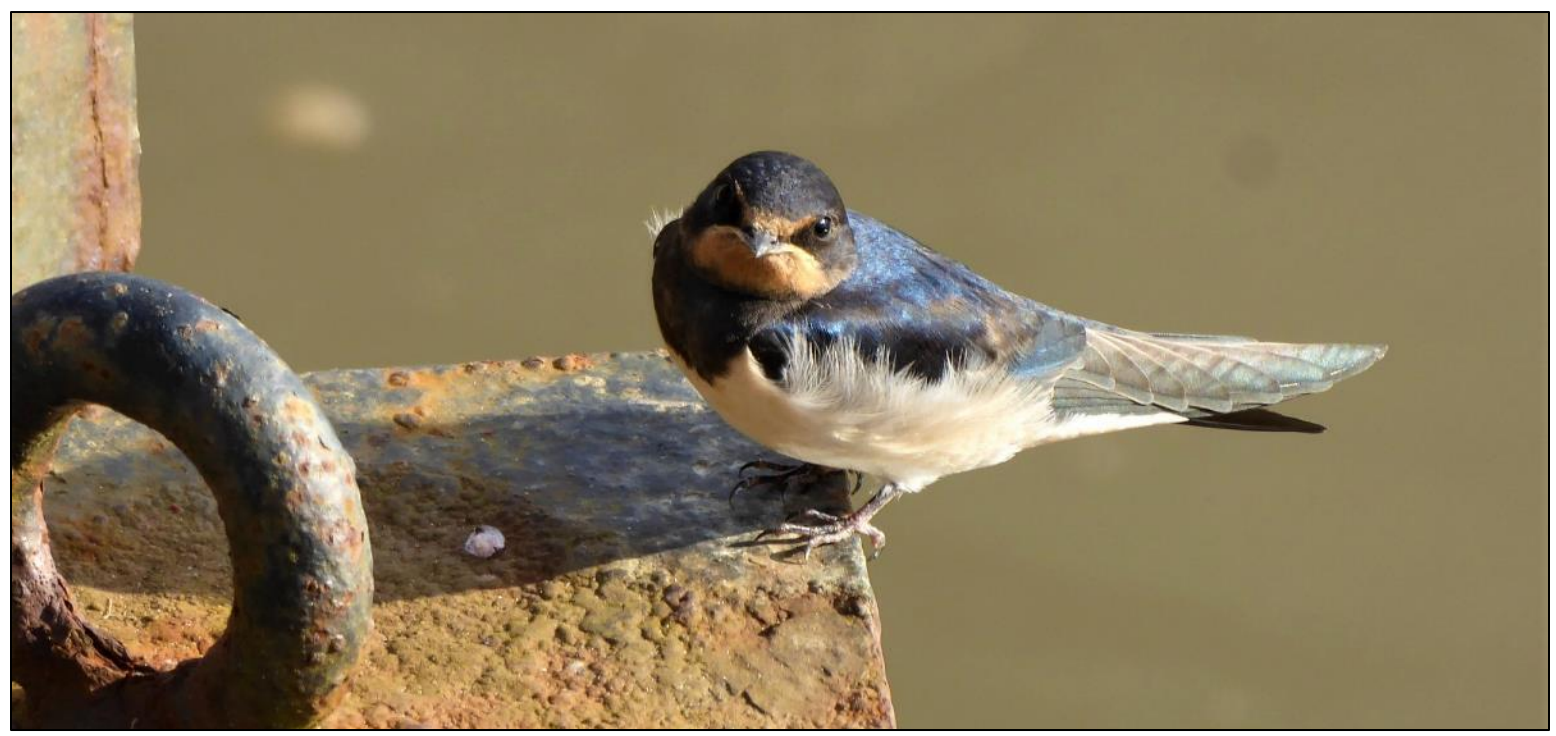
A pleasing shot of a barn swallow at Buck's Beck, Cleethorpes - Image © Nick Coulbeck

03/07/2022 Cleethorpes House Martin, Barn Swallow