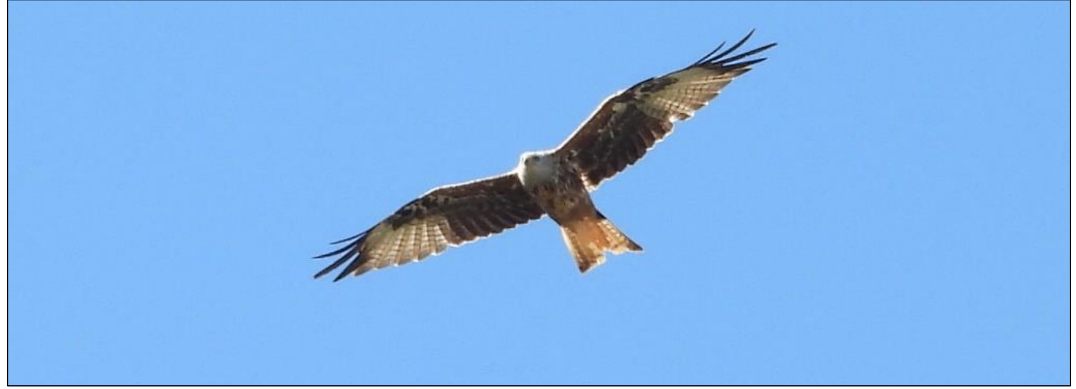
Red Kite over South Willingham

11/07/2022 Gibraltar Point Spotted Redshank, Wood Sandpiper Frampton Marsh 2 Spotted Redshank, 6 Spoonbill South Willingham Buzzard, Kestrel, Red Kite, House Martin, Barn Swallow, Swift