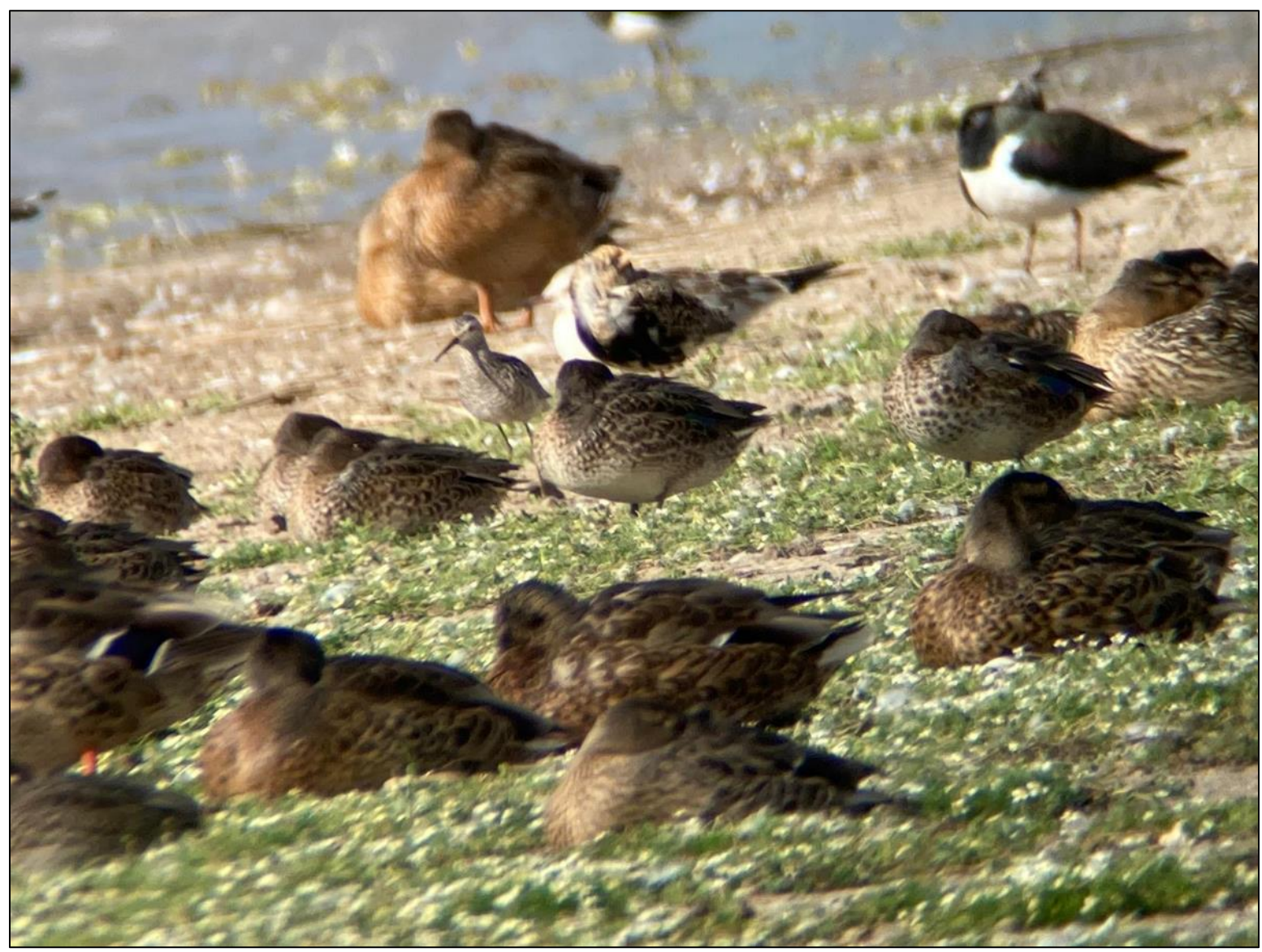
Stilt Sandpiper briefly at Alkborough Flats

Frampton Marsh 8 Spotted Redshank, 5 Spoonbill Gibraltar Point Short-eared Owl, Spoonbill Halton Marsh Spotted Redshank Winter's Pool Redwing Whisby Garganey, 3 Hobby