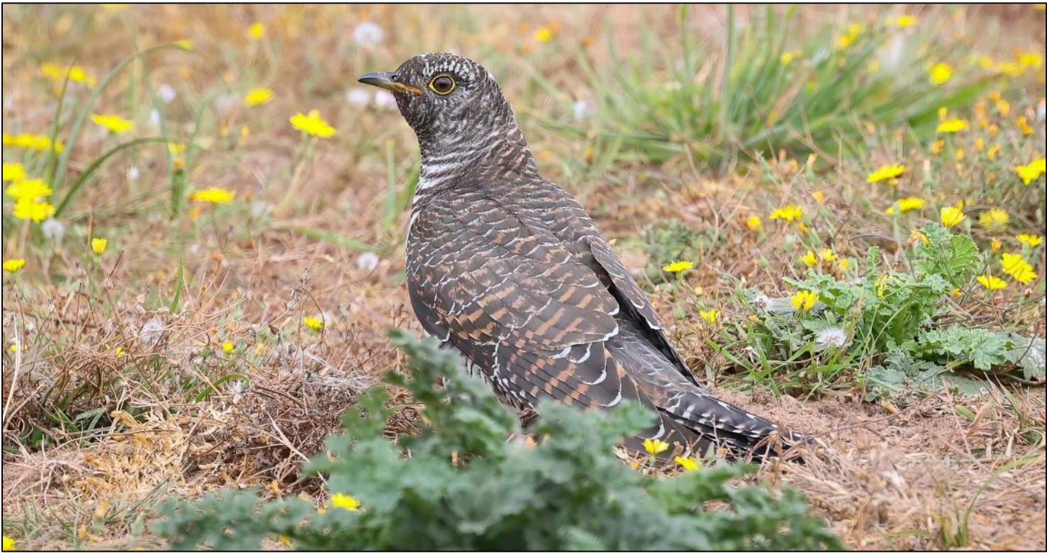
A juvenile Cuckoo at Saltfleetby/Theddlethorpe NNR 27th July 2022