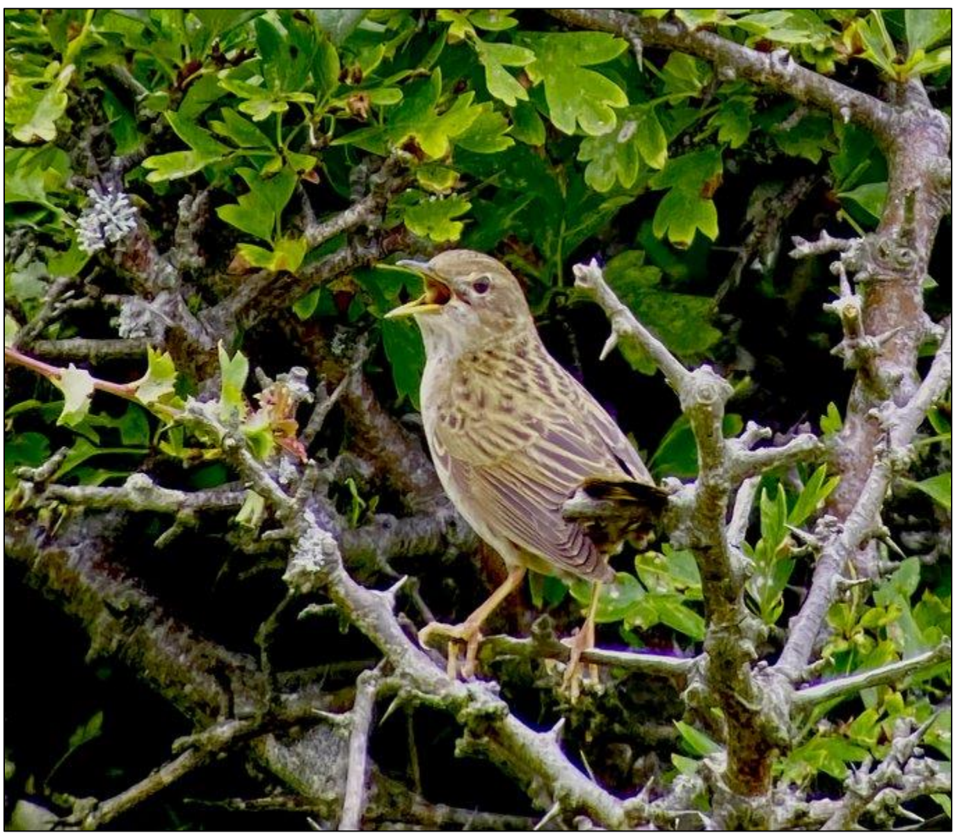
Grasshopper Warbler at Donna Nook

02/07/2022 Alkborough Flats 9 Spotted Redshank, 7 Spoonbill Donna Nook Grasshopper Warbler