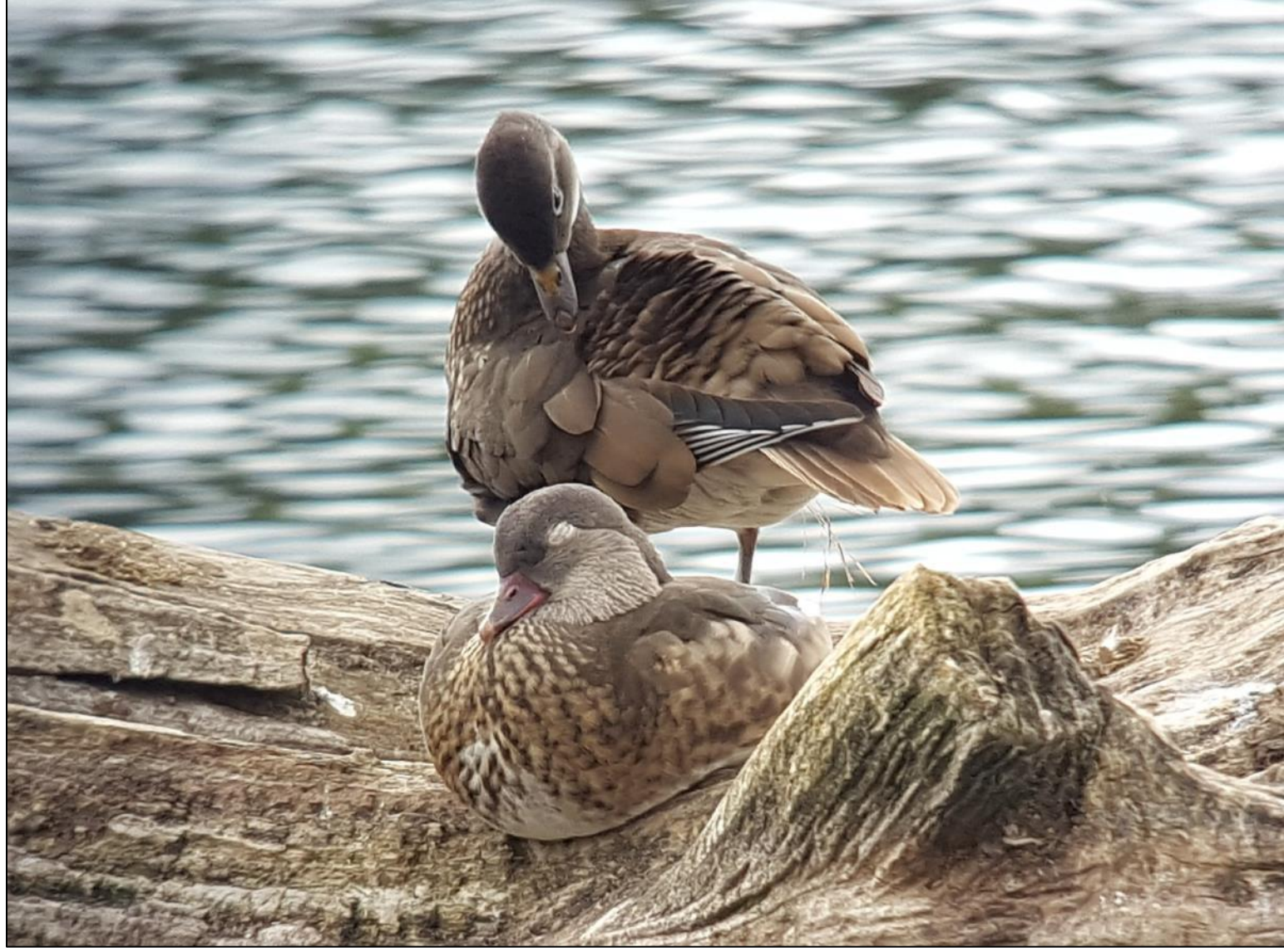
Two Mandarin Duck at Denton Reservoir

24?07/2022 Alkborough Flats Stilt Sandpiper Boultham Mere Great White Egret Chapel Point Cory's Shearwater Denton Reservoir 2 Spotted Flycatcher, 2 Mandarin Duck