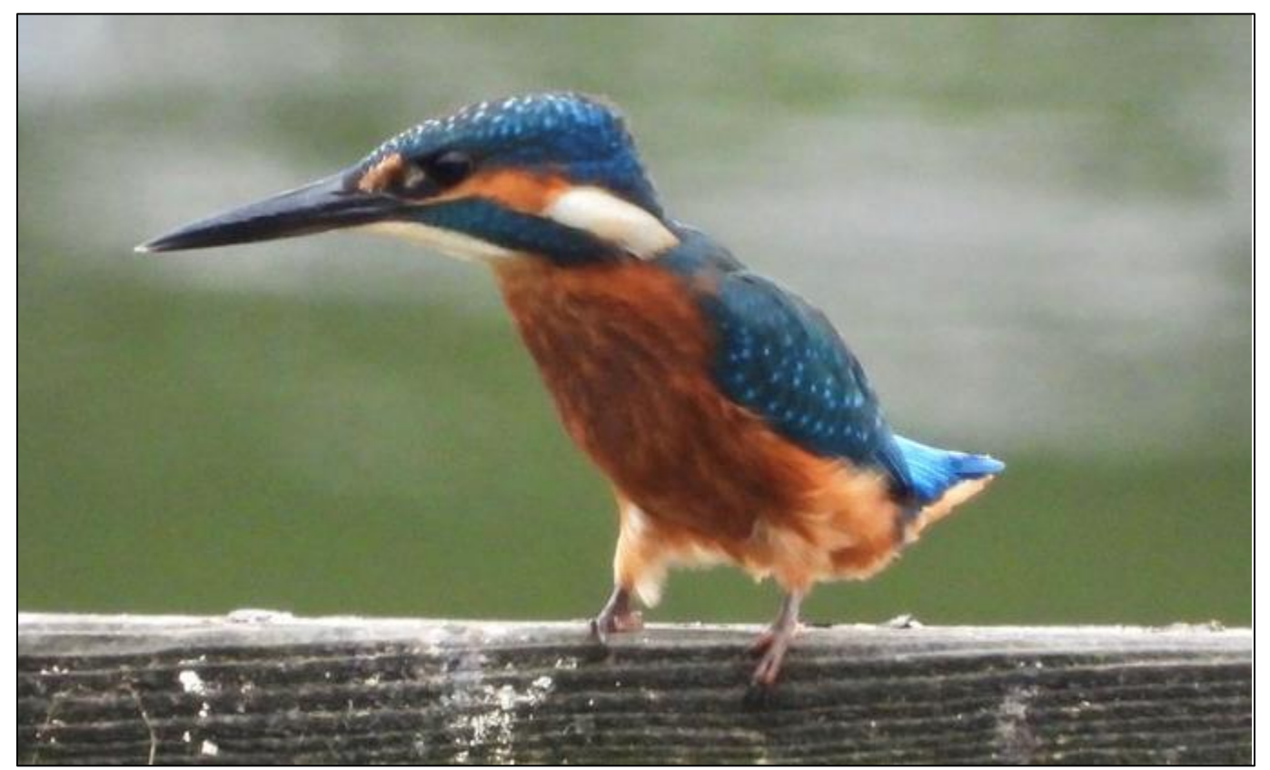
One of the two Kingfishers that showed well at Boultham Mere

31/07/2022 Alkborough Flats 2 Spoonbill, Stilt Sandpiper Cleethorpes CP 2 Great Crested Grebe, Kingfisher Boultham Mere Peregrine Falcon, 2 Great White Egret, 2 Little Egret, Kingfisher