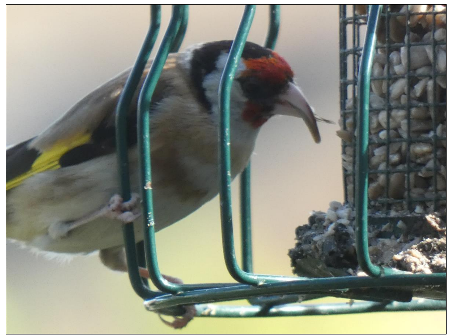
Unusual Goldfinch in the Scunthorpe area