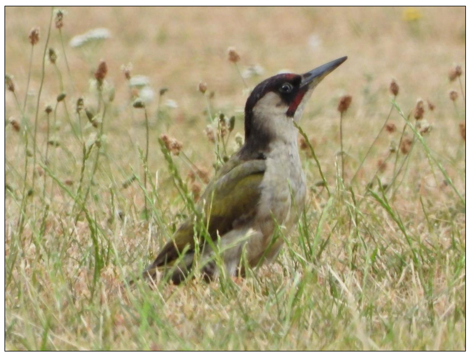
An unusual black-headed Green Woodpecker in a Swanpool garden