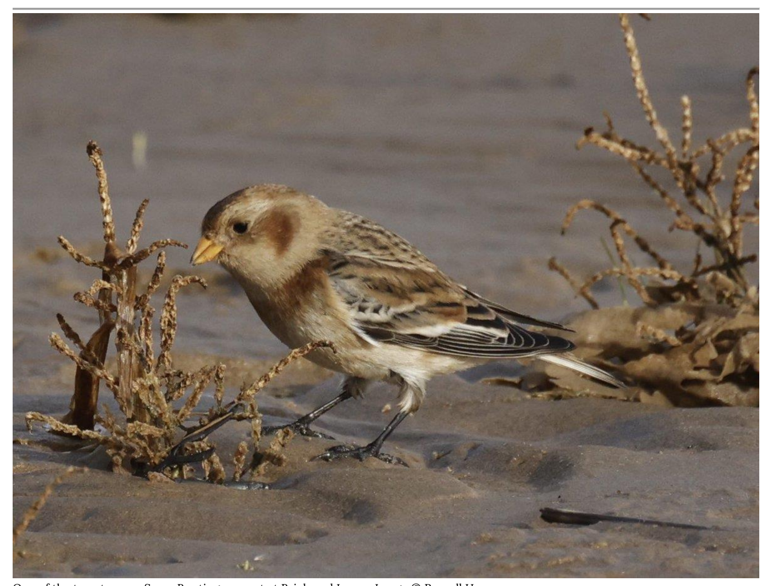
One of the twenty or so Snow Bunting present at Brickyard Lane