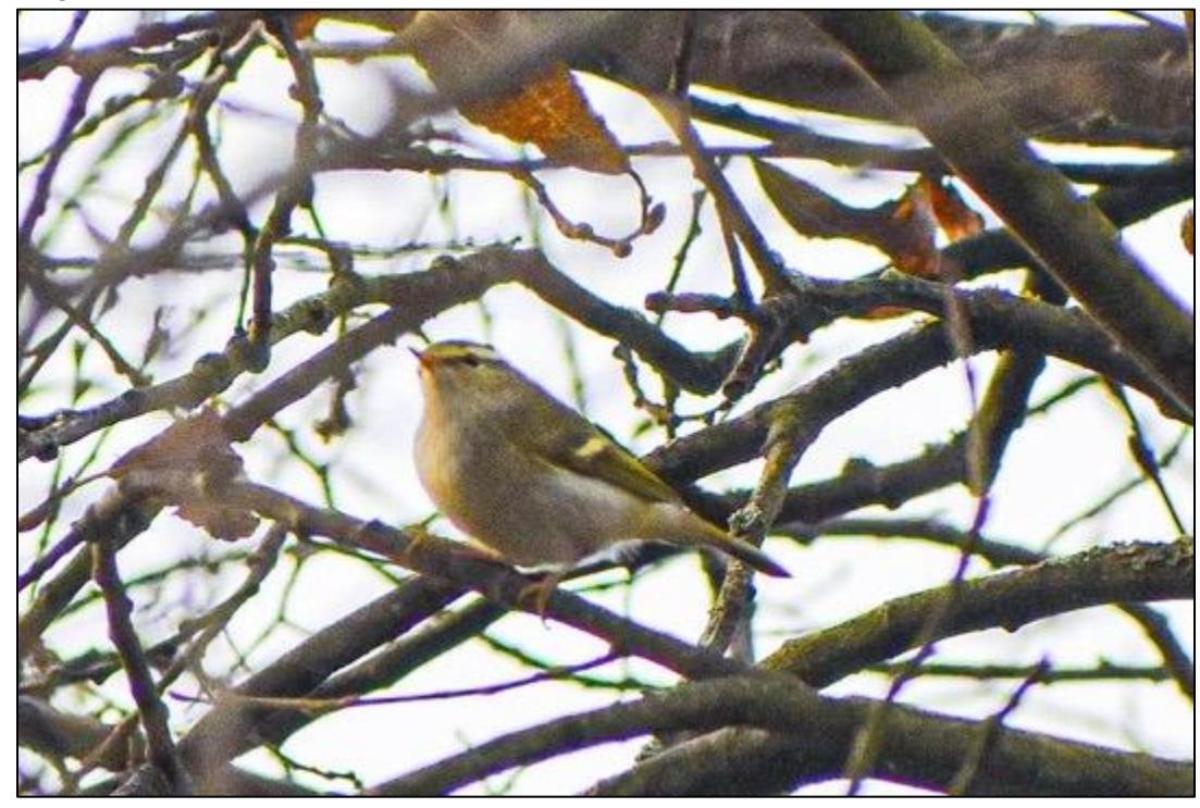
Yellow-browed Warbler Boultham Mere