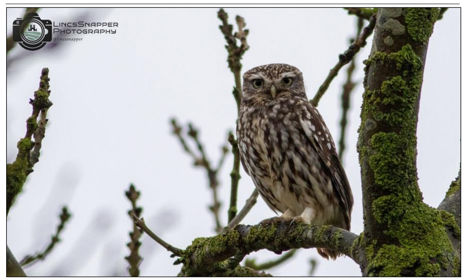
One of two Little Owls from near Brandon - Image © Steve Nesbitt