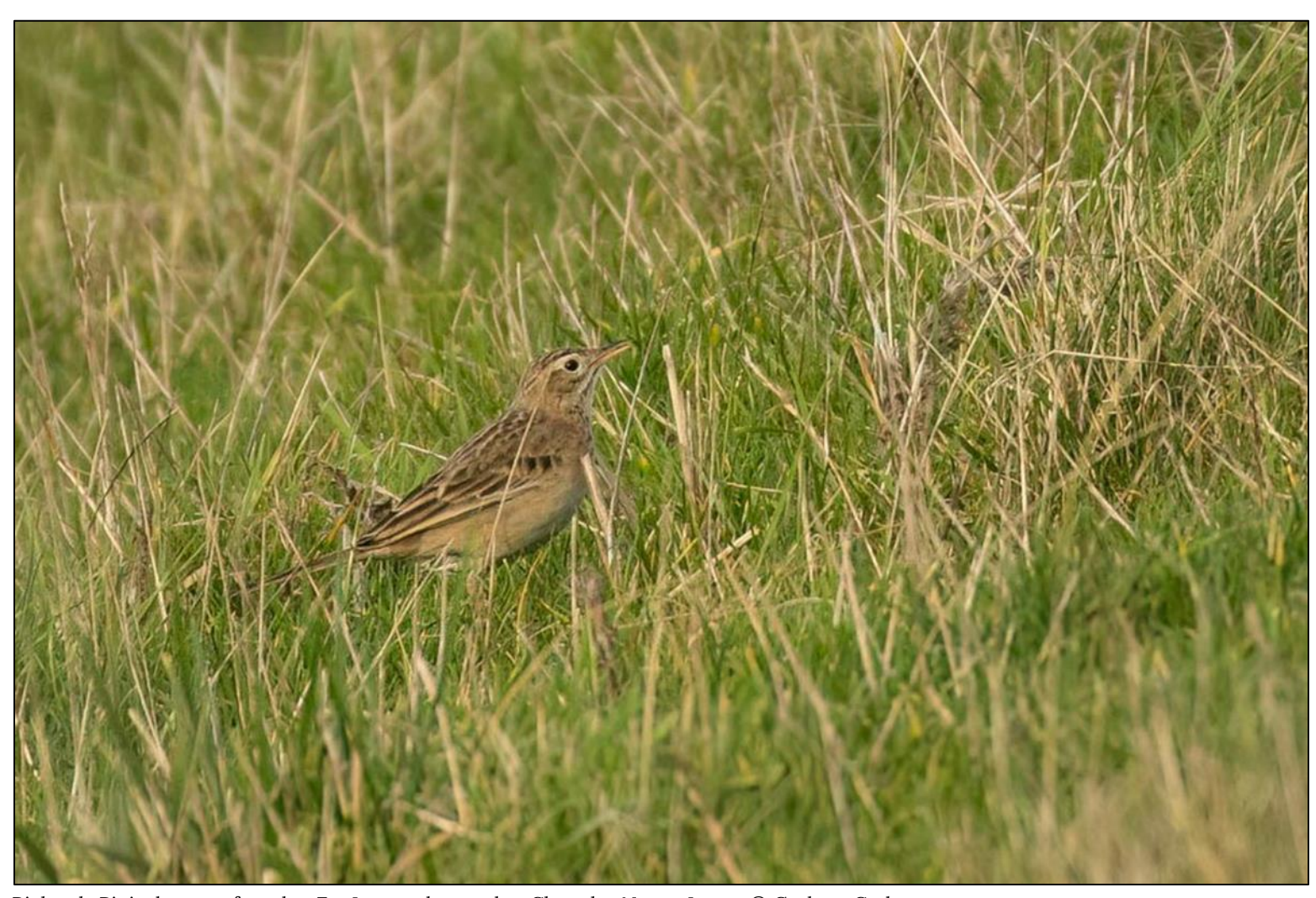
Richards Pipit that was found at Far Ings and moved to Chowder Ness