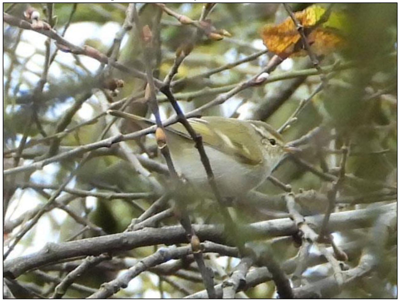
The elusive Yellow-browed Warbler present for a second day at Boultham Mere

Cetti's Warbler, Goosander, Kingfisher, Merlin, 10 Whooper Swan, Yellow-browed Warbler