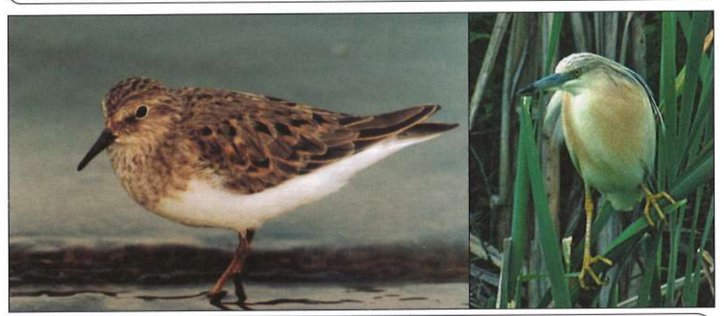
Left: Temminck's Stint, Toft Newton Reservoir, May 1999. Right and below: Squacco Heron, Messingham, June 1999.