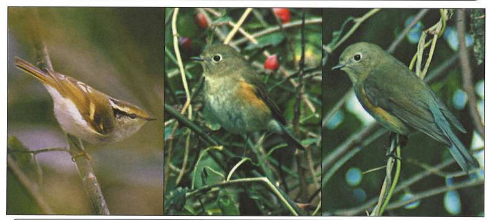
Left: Pallas's Warbler, Gibraltar Point, October 1999. Centre & Right: Red-flanked Bluetail, Skegness, October 1999.