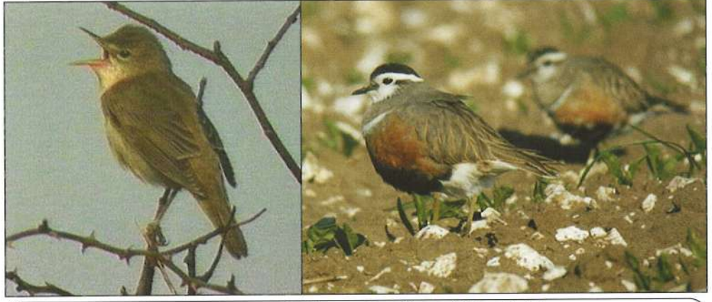
Left: Marsh Warbler, Far Ings, May 1997. Right: Dotterel, Owmby (by Searby), May 1997.