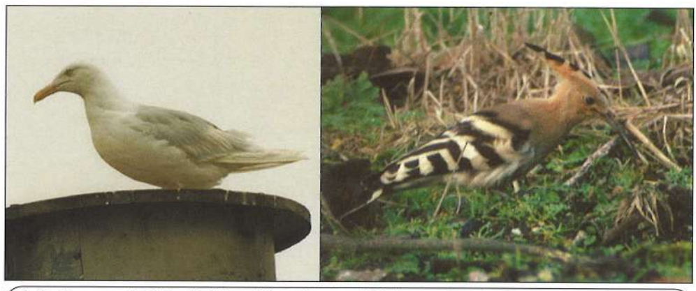
Left: Glaucous Gull, North Kelsey Moor, August 1999. Right: Hoopoe, Barton, October 1999.