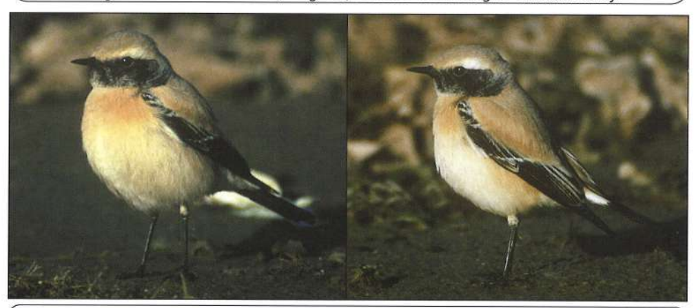
Desert Wheatear, Rimac, November 1999.