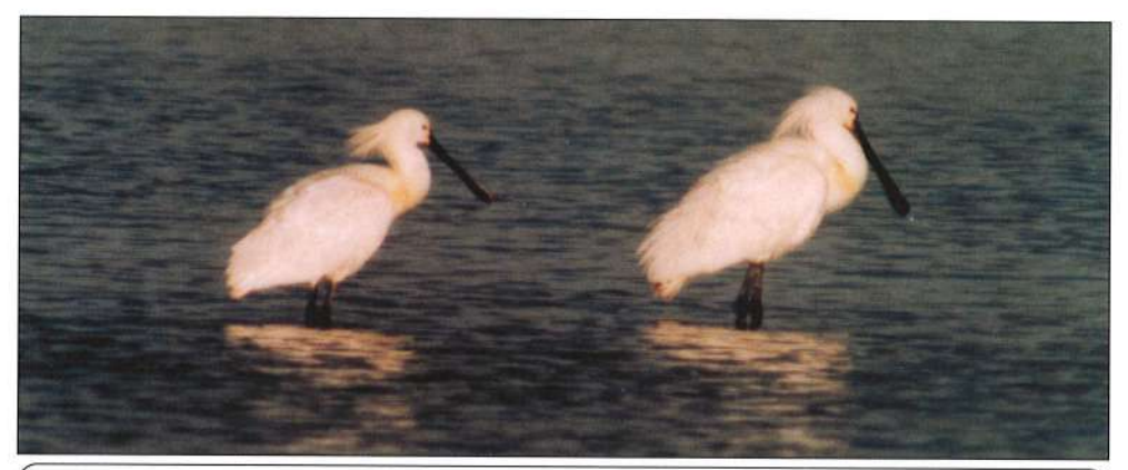
Spoonbills, Gibraltar Point, April 1998.